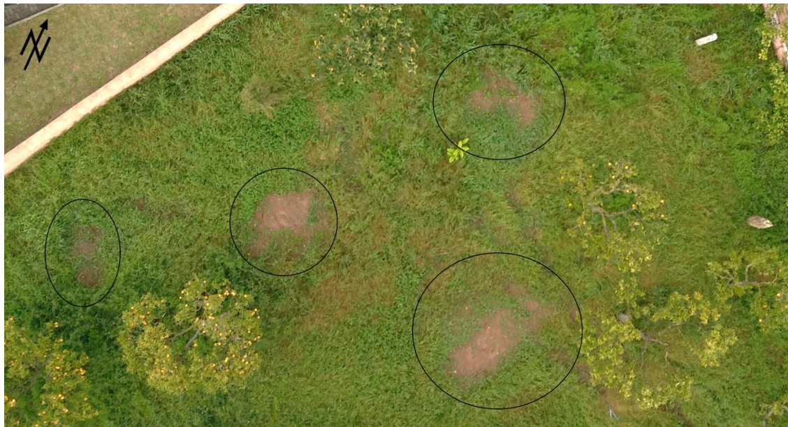
Figure 1. Drone photo acquired in the private garden of the suspect. Four ground anomalies are clearly visible.

the identification and location of possible clandestine pits relative to two missing people who had disappeared and had been presumed murdered. The drone was used to investigate a private garden to which access had been denied, as the police had not yet obtained a search warrant from the proper authorities. As can be seen in Figure 1, these anomalies are particularly evident even without the use of particular filters or image processing. The problem that was immediately evident to law enforcement was the presence of four superficial anomalies, while there had been only two people declared as missing.