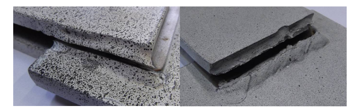
Figure 2. Typical failure mode for longitudinal welds (left) and transverse welds (right).

welds failed in the fusion zone at an angle ranging between 30° and 50° measured from the plate surface. Because the failure occurs in the weld metal, the intermittent undercut, which is visible in some welds, did not influence the ultimate load.