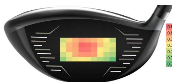
Figure 1. COR map overlaid across a driver face.

COR mapping refers to the process of repeated COR tests across a wide area of the face of a golf club. It is an effective tool to evaluate the performance of a head because the results are a function of the entire clubhead design. Critical engineering parameters such as mass, center of gravity, moments of inertia, face flexibility, and structural rigidity are all influential for this test. An example of a driver's COR map is shown in Figure 1.