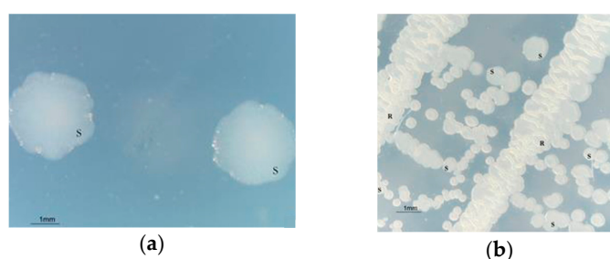
Figure 1. Pseudomonas spp. 4A strain colonial dissociation in LB-agar plates. (a) Smooth colonies (S), and (b) a mixture of Rough (R) and Smooth colonies (S).

In the present study, we have isolated from field ashes samples of pruning wastes, after selective enrichment cultures two bacterial strains able to use 5-(hydroxymethyl)-furfural (HMF) and furan derivatives as the sole carbon source in minimal medium with ammonium chloride as nitrogen source under aerobic conditions. By comparison of the 16S RNA gene sequence with existing sequences, the isolated strains were identified as Pseudomonas spp. 3A strain and Pseudomonas spp. 4A strain. Two distinct colonial types, R-type and S-type, appeared among the bacterial isolates when they were cultivated on solid Agar medium (Figure 1). S (smooth) colonies are circular, smooth or continuous edge, shiny surface; and they easily dispersed in water, giving homogeneous suspensions. R (rough) colonies often have a wavy or scalloped edge, they are flat, rough texture and matt appearance, and they develop a characteristic wrinkled appearance and do not disperse well in water. This fact has been described as colonial dissociation [1]. Colonial dissociation depended on the culture medium. Pseudomonas spp. 3A and Pseudomonas spp. 4A cultured in rich medium (LB-Agar) formed two types of colonies (S) and (R) (Figure 1b) although the type R colony was predominant. However, cultures in M9-HMF-Agar medium only gave rise to S-type colonies (Figure 1a).