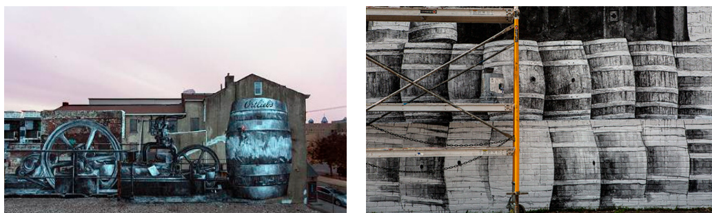
Figure 2. Two of the murals made by Phillip Adams in Philadelphia.

Paul Santoleri represented “the frenzy and vivacity of the city of Philadelphia” in a mural built on the side of a refinery tank located on the road from the airport to the center of the city. The design is a “caricature” representation of the city’s architecture (Figure 4).