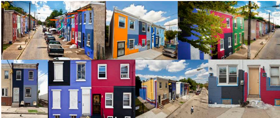
Figure 3. Pictures of the facades of houses that have been the subject of the project “A place to call home” in the city of Philadelphia.

Among the many artistic examples produced by the Mural Arts program, it is worth mentioning the Dutch urban sculpture by Jeroen Koolhaas and Dre Urhahn, also known with the Haas & Hahn nickname, which in 2010 revolutionized the fifth visual of the historic Germantown Avenue (“the Avenue”) north of Philadelphia (Figure 5). The project, named Philly Painting, affected the façades of 51 showcases that were painted in a palette of over 50 colors reflecting the typically rich and complex character of the neighborhood.