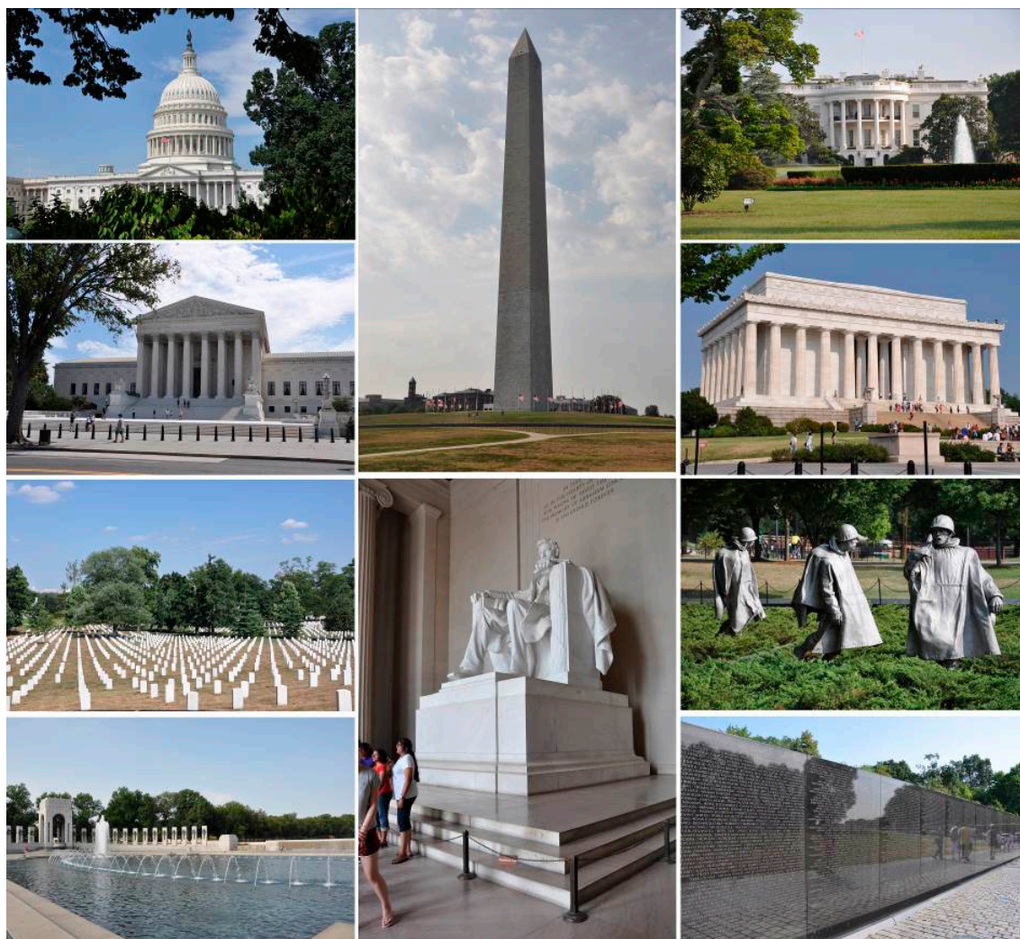
Figure 6. Pictures of some monuments and historic buildings in Washington: the Capitol, the White House, the Supreme Court, Washington, Lincoln, World War II, the War of Korea and Vietnam, the Cemetery of Arlington.

Korea War memorial is located near the Lincoln Memorial on the National Mall in Washington, DC. The monument recalls the sacrifices of the 5.8 million Americans who served in the US armed forces during the three-year period of the Korean War. The memorial is made up of a series of statues of soldiers placed in juniper bushes and separated from polished granite strips, giving a semblance of order and symbolizing Korea's rice paddies (Figure 6). The color uniformity of the Washington city landscape finds more confirmation in the white crosses of the Arlington National Cemetery tombs as well as in the concrete cladding ceilings of underground subway stations [1].