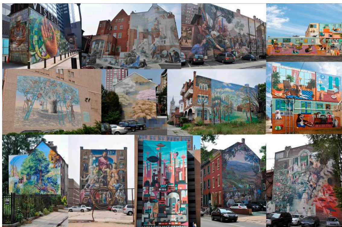
Figure 1. Some images of murals made in Philadelphia under the "Mural Arts" program.

The project has allowed authors to take an active role in enveloping neighborhoods and communities as they are all involved in creating works: it is the people in the neighborhood who choose the wall to paint and process the subject together with the artist, thus adding their contribution in the realization process.