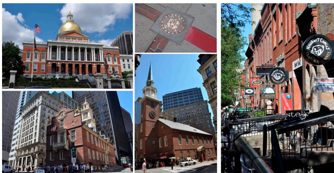
Figure 9. Some images of Boston's Old Town: Left on the Freedom Trail; to the right a glimpse of the brownstones neighborhood.

Conflicts of Interest: The images reproduced are not subject to third party licenses or copyright as they are the property of the author of the proceedings, with the exception of figures n.2 ( http://phillipadams.com/ ), n.4 ( https://www.muralarts.org/artworks/a-place-to-call-home/e ) n.5 ( https://www.muralarts.org/artworks/philly-painting/ )