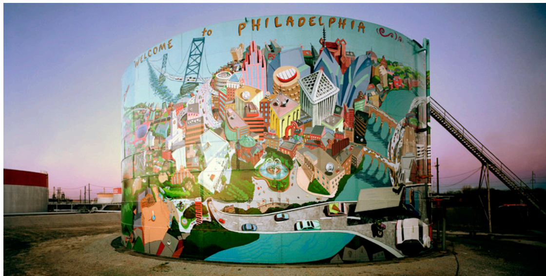
Figure 4. Image of the wall made by Paul Santoleri representing “the frenzy and vivacity of the city of Philadelphia” on the side of a refinery tank.

Among the many artistic examples produced by the Mural Arts program, it is worth mentioning the Dutch urban sculpture by Jeroen Koolhaas and Dre Urhahn, also known with the Haas & Hahn nickname, which in 2010 revolutionized the fifth visual of the historic Germantown Avenue (“the Avenue”) north of Philadelphia (Figure 5). The project, named Philly Painting, affected the façades of 51 showcases that were painted in a palette of over 50 colors reflecting the typically rich and complex character of the neighborhood.