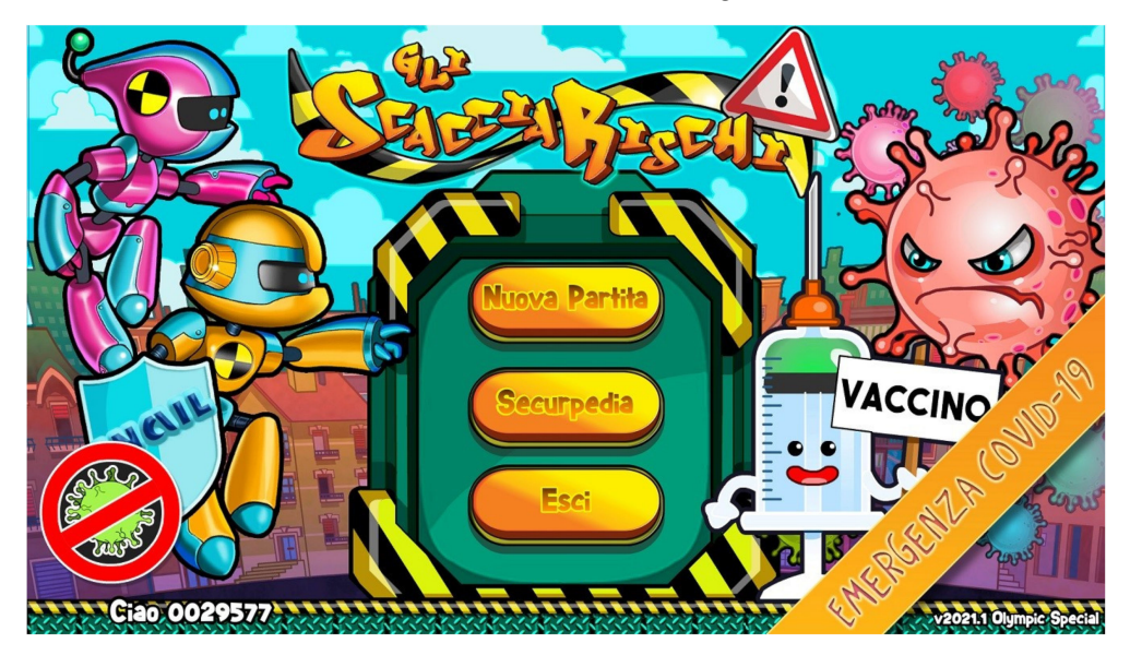
Figure 1. The starting interface of Scacciarischi.

Through a scenic design in 2D graphic (recalling the classical game Super Mario), Scacciarischi proposes three levels representing different life contexts (home, school and work), each one leading specific risks and dangers. The transition from one level to the next can happen thanks to several both mandatory and optional rewards (having again a symbolic configuration, such as facemasks and security tools), enabling the players to defeat the enemies as well as to gain lives/score (Figures 1 and 2). In addition, at the end of each level, the hero has to take down a harmful Dangerbot.