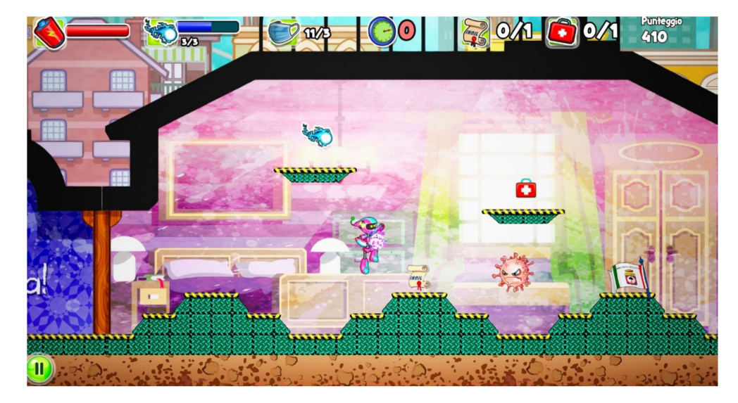
Figure 2. A scene from the first level of Scacciarischi.

A section of the serious game is dedicated to the "Securpedia", an encyclopedia of risks, which participants are required to consult before playing in order to overcome some game obstacles. In the passage from one level to the next, players have to answer some questions concerning risks, dangers and preventive behaviors. The Securpedia is structured in accordance with both the several contexts/game levels (home, school, work and COVID-19)