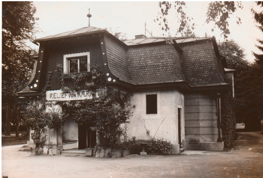
Figure 3. Shelter building for the Landscape Relief Model of Carinthia with changed roof membrane made of tin (around 1925).

a scientific work of art (cf. [9]), even if we are not taking into account the magnificent value-adding by means of most advanced IT technology (see next chapter).