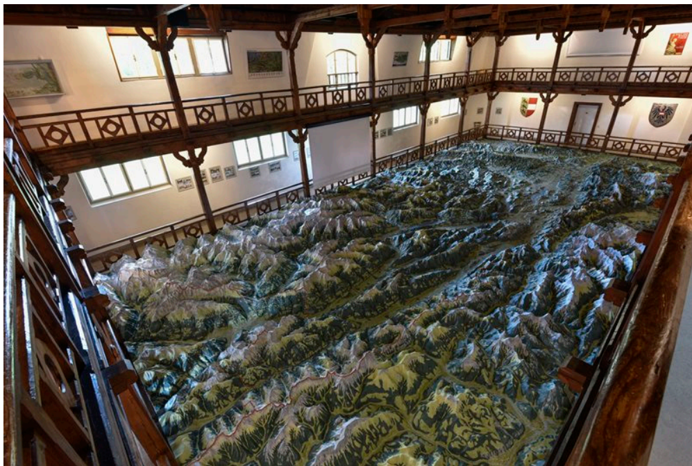
Figure 4. Present-day impression of Relief von Kärnten without IT augmentation. In the upper center, the vertical screen for video projection can be seen. From the Internet Presentation of the Municipal Museum and Archive of the City of Villach.