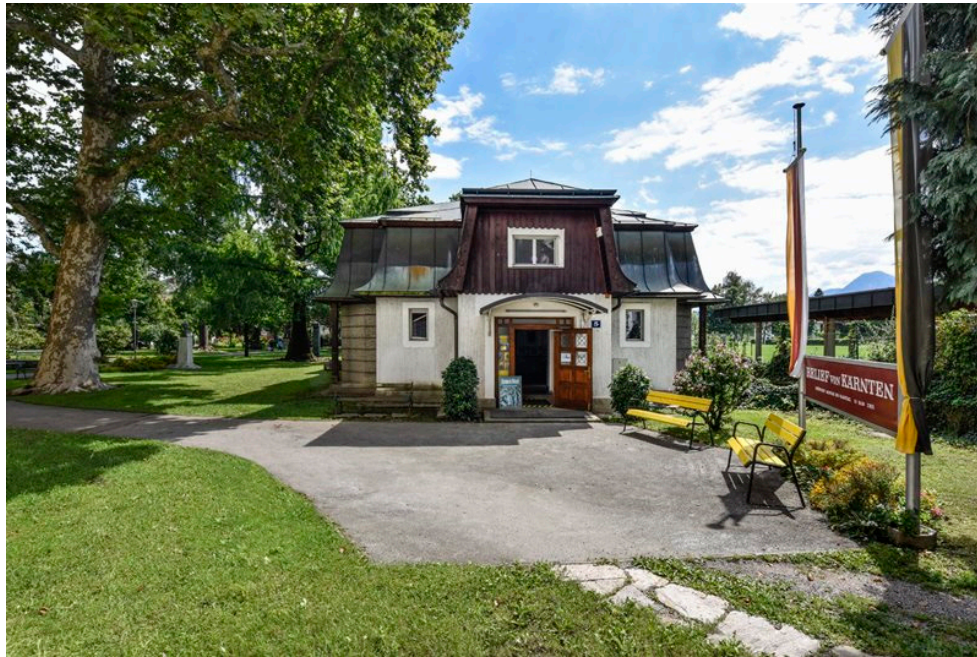
Figure 5. Present-day view of the Relief von Kärnten Pavillon at the Schillerpark in Villach. From the Internet Presentation of the Municipal Museum and Archive of the City of Villach.

“augmenting” the relief model with some of his landscape pictures. Although this was, for protective reasons, not possible, the idea was born to “value-enhance” the landscape relief model by adding complementary geo-information. So, for some years, the Municipal Museum of Villach began to investigate technical possibilities for materializing an improved modern form of museal communication that allows an up-to-date and innovative presentation and, at the same time, acknowledges the statutory provisions of legal monumental protection (Figure 5).