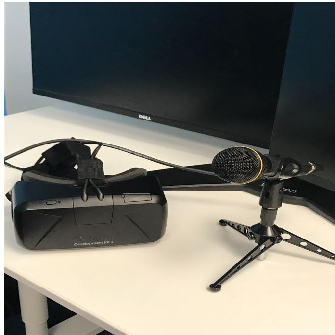
Figure 1. The Oculus Rift headset and microphone used for voice input.