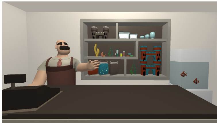
Figure 2. Image of Bob making eye contact with user.

Though the game play of Bob's Fish Shop is simple, based largely on short interactions supported by text scripts, the underlying architecture of the game requires integration of several technologies. In addition to the VR itself, the game utilizes voice recognition to engage the user and the virtual shopkeeper, estimates joint attention based on the player's center of focus in the virtual reality environment (VRE), and incorporates rule-based artificial intelligence to guide transitions throughout the game.