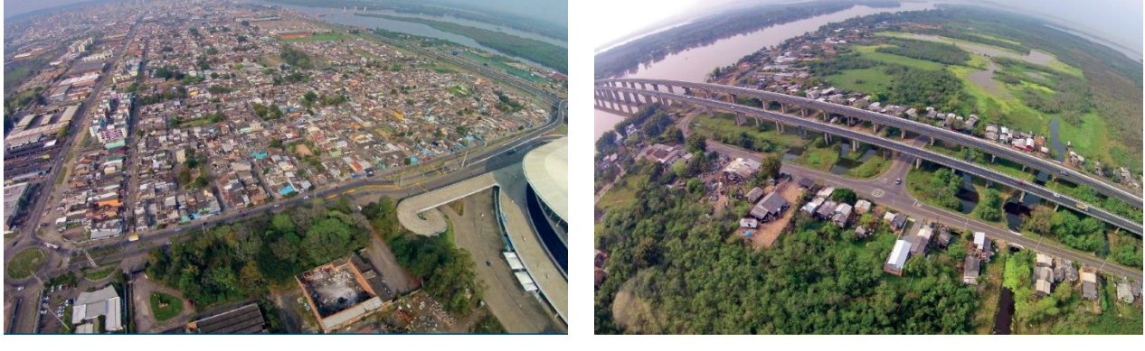
Figure 2. Landscapes in the areas of interest: ( a ) urban pattern in the Humaitá-Navegantes region; ( b ) urban pattern in the Arquipélago region.