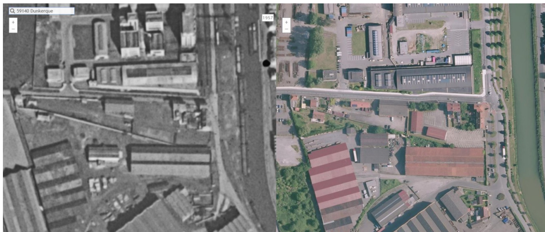
Figure 4. Comparative aerial picture of the second site Marchand in 1957 on the left, and in 2015 on the right.

Beyond the unknown pollution that oil sites created and the lack of information on many others, there are other significant impacts. When the governmental website vaguely locates former oil activities, it can detail if a cleaning process was carried out and whether the function has changed. Sometimes, when geographic information is available, the pollution remained and public and private authorities built houses, shops, parks or schools on these former petroleum sites, as is the case with the old refinery