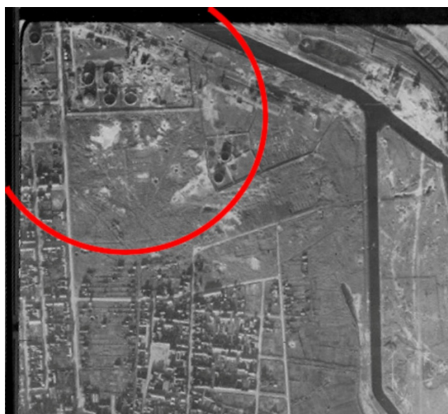
Figure 1. Aerial picture of Dunkirk in 1944 with the destroyed oil storages. The concentration of impact around the site reveals its strategic nature.

The Second World War, which destroyed three quarters of Dunkirk, had an influence on the petroleum pollution in the city. Considering how strategic this resource was during the war, both forces destroyed storages and refineries along with the rest of the city (Figure 1). The petroleum that these facilities contained ended up polluting the soil of the port city. The post-war reconstruction of petroleum facilities on the same sites prevented any cleaning process; there was a need for inhabitants and public authorities to fasten the renewal of the port and an absence of environmental considerations before the 1970s.