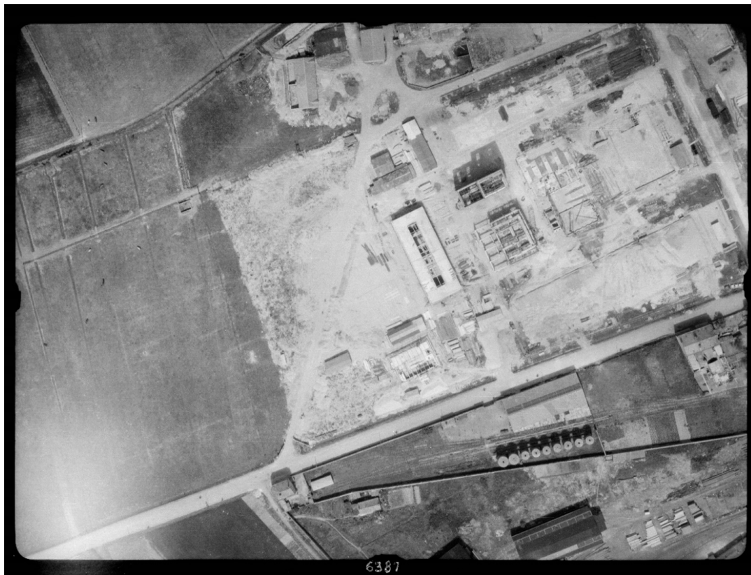
Figure 3. Aerial picture of Dunkirk in 1947, with the alleged second site of Marchand. The railway is visible within the site and leaves on its east part, towards the canal Bourbourg, as explained in the article of Thelliez. Picture of the service “remonter le temps” from the French National Institute of Geographic and forest information, or IGN. © IGN