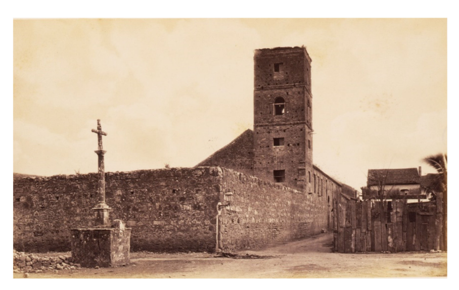
Figure 6. Ruins of the Monjas de la Concepción Convent in 1875 by E. Muybridge [26].

There are hypotheses such as that of Tejeira Davis [25] (pp. 12–14), that place the new buildings on the traces of the old convent. Specifically, the National Theater would be partially built on what were the orchards and the cloister of nuns, since other parts were outside the current built area and have disappeared. In fact, the same study reveals that before its demolition, the building itself was already used as a theater, thus anticipating the current use even before its disappearance, being called "Theater of the Nuns". The work of architect Gennaro N. Ruggieri and the successive restorations of the building to this day bear no relation to the original historical religious value.