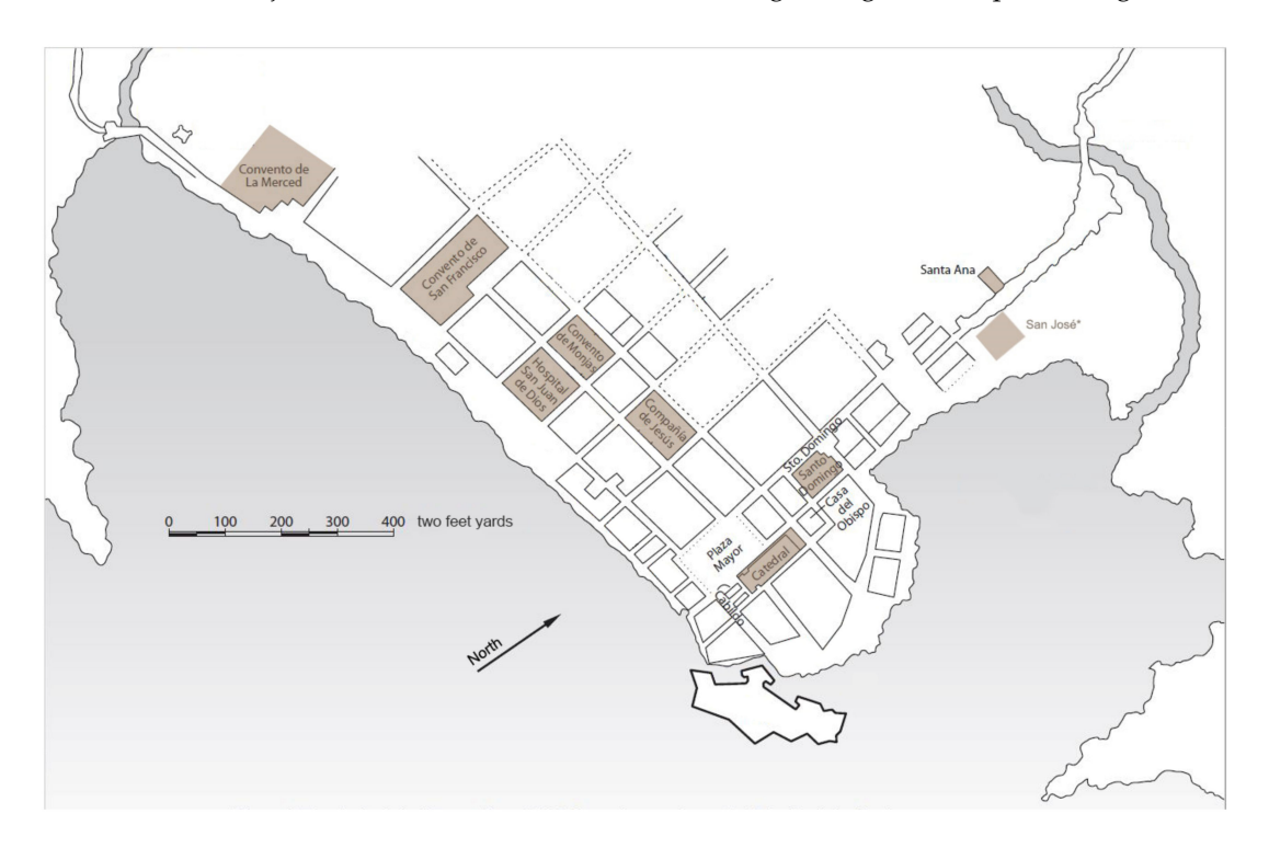
Figure 1. Location of religious buildings in Panamá Viejo, including San José. Figure edited by the authors from the Plan of Panama City in 1609, based on Cristóbal de Roda cartography [9].

Therefore, it is entirely possible that the first section of the Panamanian urban layout was formed by a rectangle from the main square to the La Merced, through Calle de la Carrera—the first street running south to north, drawn west—east and parallel to the coast of the Pacific Ocean. It is possible that the eastern boundary of the rectangle was the primitive Santo Domingo. These pre-existences and initial outlines will be fundamental in understanding the later constructions. On the cartographic outline of Panamá Viejo, we have identified the location of eight religious complexes (Figure 1).