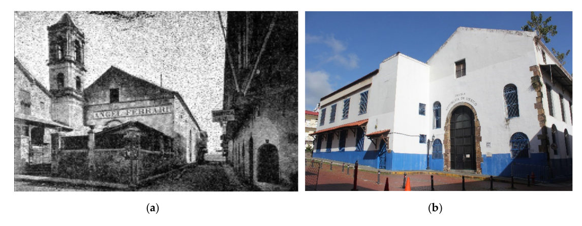
Figure 7. San Juan de Dios Hospital: (a) Church in 1888 with the original tower [28]; (b) Current school.

by religious facilities is destined, on one hand, for educational use. Part of the building was converted into the Republic of Mexico School (Figure 7), which tried, to some extent, to recover the image of the pre-existing church. On the other hand, the rest of the premises were changed to commercial use. There is no trace of the tower or of what once was the convent.