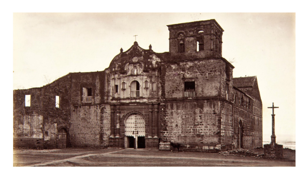
Figure 4. Church of San Francisco in 1875 by E. Muybridge [18].

Today, only the San Francisco Church remains from the entire original convent complex (Figure 4), the only piece to survive all changes of use. However, we must also mention that this icon of the colonial baroque has also gradually changed its character and heritage value due to successive restorations. In 1918, it was "restored and completely distorted" according to historian Ángel Rubio. This criticism adds to the claims of several Panamanian historians such as Narciso Garay and Rubén D. Carles, pointing out that "the restoration effort of our pious people has destroyed the facades of our temples, their pulpits and altars made of a single piece and carved so finely that they resemble rich goldwork, to be replaced by concrete facades, pulpits and altars, more modern and colorful, but less rich in art and splendor" [5].