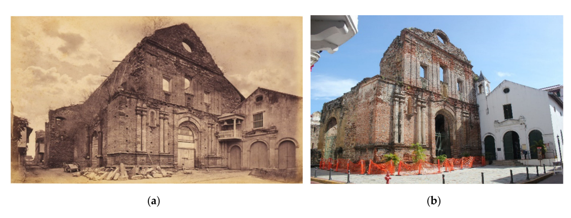
Figure 8. Ruins of the Santo Domingo Convent: (a) State in 1875 by E. Muybridge [29]; (b) Today.

The Dominicans took longer to settle in Panamá Viejo than other orders, since it was not until 1571 that they founded what began as a church and rooms for the friars. However, in the transfer to the new city, they were among the first religious to establish their convent. By 1678, they had already built the Santo Domingo Church and Convent, together with San Francisco, representing the most monumental temples in Panama. The convent was affected by the fires of 1737 and 1756, in which the tower and its interiors collapsed. However, walls and arches remained standing (Figure 8), particularly the lowered arch, known as the "flat arch", that supported the choir of the church [5] (p. 158).