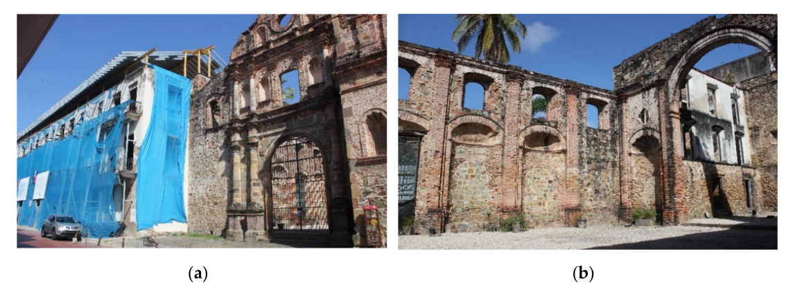
Figure 9. Ruins of the Compañía de Jesús and Hotel under construction: (a) Exterior Facade; (b) Interior of the original Church.

As we have mentioned previously, in the Historic District Standards Manual, buildings are classified into four orders of protection. In this case, all the buildings derived from the Jesuit convent (both public and private) managed to achieve maximum protection or first order, except for the building previously used for the Javeriana University, which was classified as second order. This fact gives us information about the heritage loss: on the one hand, the lack of understanding of the convent as a single complex, built for the same purpose (educational-religious) and, on the other hand, the different intervention or conservation criteria for the separated pieces of the building, which will probably increase the architectural and urban value loss of what was once the Compañía de Jesús in Panama.