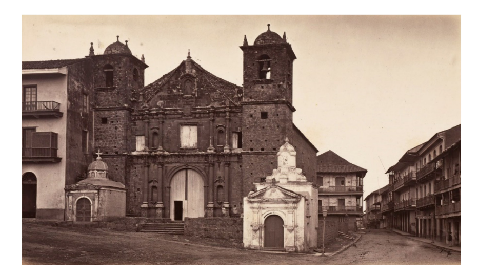
Figure 5. Church of the Merced in 1875 by E. Muybridge [19].

In 1963, several of its most outstanding architectural assets (choir and main altar) were lost in a fire and the restoration work had its deficiencies. In 1983, the order returned, carrying out several restorations in the building [20] that make it one of the most unique churches in the city, its facade being an example of both historical and artistic value.