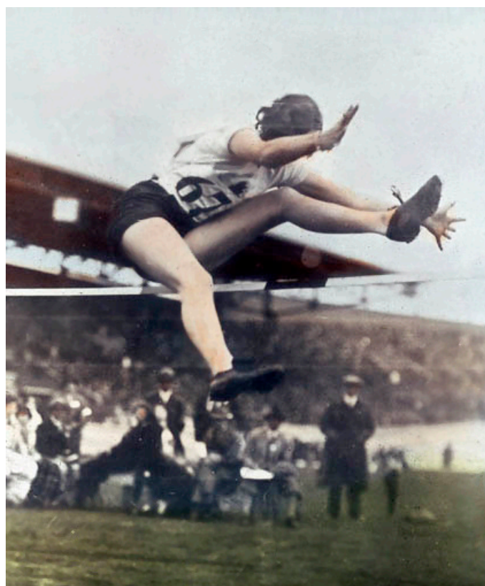
Figure 5. High Jump, scissors style.