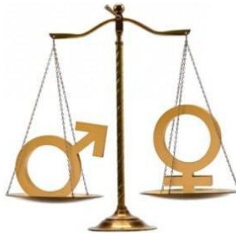
Figure 2. Equal opportunity.

The metabolic differences between men and women include muscle structure, the use of glucose, the oxidative metabolism of fatty acids and hormonal actions on the muscle. In women, there is a higher insulin sensitivity, especially in the reproductive fertile age. The muscle metabolism is also regulated by estradiol and adipokines, and, in women, metabolic response to exercise induces an increased lipolysis and a lower oxidation of glucose in the postprandial phase [20,21]. These differences can become important in the athlete's training, taking into consideration the perspective of health, wellness and disease. Gender-based medicine, however, must be managed not as a female medicine but as a medicine that takes care of the person.