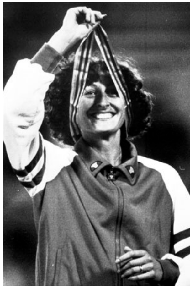
Figure 1. Mrs. Sara Simeoni, Gold Medal in high jump at the Moscow Olympic Games 1980.

first time since 1978. The ageing Meyfarth, however, replied with a 2.02 meter jump, and Simeoni won the silver medal. Because of her long-lasting successful career and championship qualities, Mrs. Sara Simeoni is widely considered one of the best Italian female athletes ever. Subsequently, Mrs. Simeoni became a physical education teacher in middle schools, and lecturer of individual sports and athletics at the University of Chieti (Italy), a job she still does today with great social and ethical commitment.