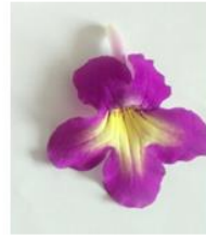
P2 x P1.35