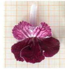
P2 x P1.21