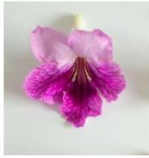
P2 x P1.2