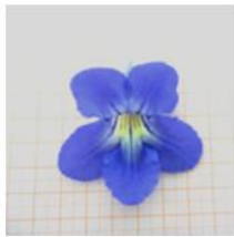
P2 x P1.25