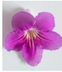
P2 x P1.19