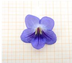
P2 x P1.24