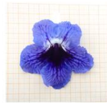
P2 x P1.3