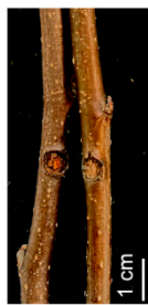
Supplementary Figure S2. Strain ZZ1 did not cause disease symptoms on pear branch. The branches were punched at the midpoint of each branch (5 mm in diameter) and sprayed with ZZ1 conidial suspensions ( 10^8 conidia/mL). The picture was taken at 10 days after spraying.