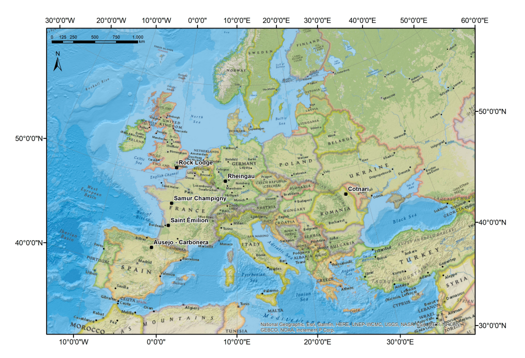
Figure 1. Location of studied European wine regions.