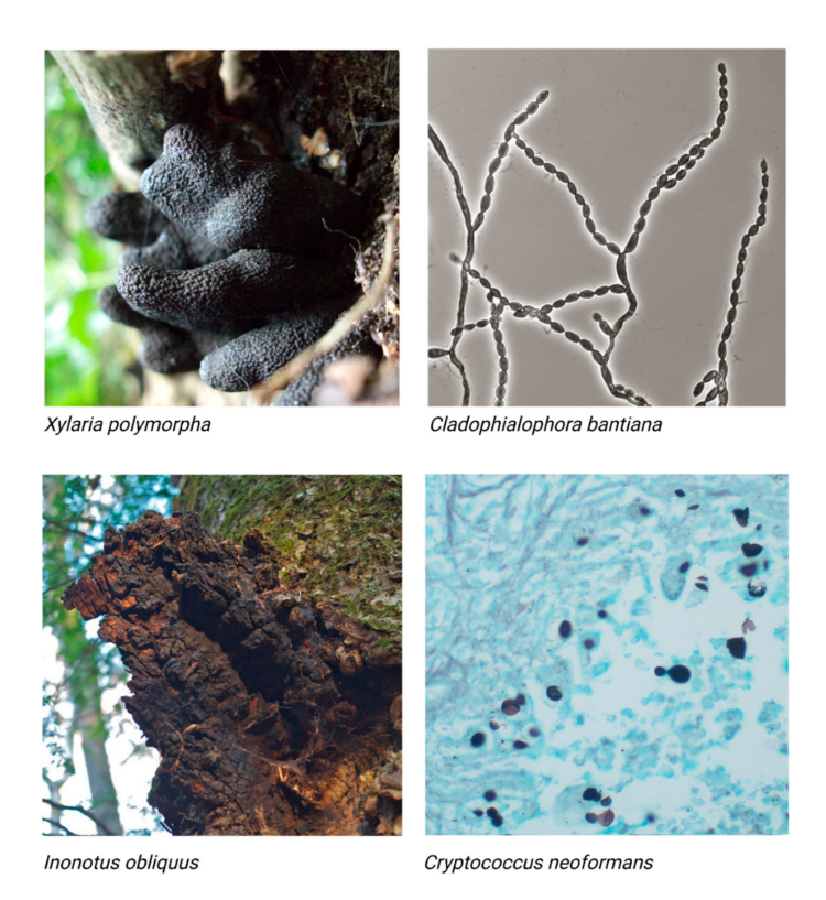
Figure 1. Panel of four images of different melanized fungi. Xylaria polymorpha (top left), a mushroom also referred to as 'Dead Man's Fingers.' The stromata of X. polymorpha have an average total length, including rooting bases, of 5 to 8 cm by an average 2 cm diameter [27]. "Black fungi— Xylaria polymorpha (dead man's fingers)" by ohi007 is licensed under CC BY-NC-SA 2.0; Cladophialosphora bantiana (top right), a pathogenic mold. C. bantiana conidia are approximately 5 to 10 μm in length [28]. "File:Cladophialophora bantiana UAMH10767.jpg" by Medmyco is licensed under CC BY-SA 4.0; Inonotus obliquus (bottom left), also known as the Chaga mushroom. Chaga appears as a sclerotia ranging from 5 to 40 cm in diameter [29]. "Chaga mushroom ( Inonotus obliquus )" by Distant Hill Gardens is licensed under CC BY-NC-SA 2.0; Cryptococcus neoformans (bottom right), a pathogenic yeast. Cryptococcal cells range from 5 to 10 μm in diameter [30]. "Cryptococcosis—GMS stain" by Pulmonary Pathology is licensed under CC BY-SA 2.0. Images presented are not to scale.

heavy melanization was associated with survival in microcolonial rock fungi exposed to long periods of desiccation [13]. Some fungal species in spalted woods will melanize in response to periods of low water content, creating black zones in the wood [14]. These numerous protective functions enable melanized fungi to reside in some of civilization's most extreme environments, from deep-sea vents to the International Space Station [15,16].