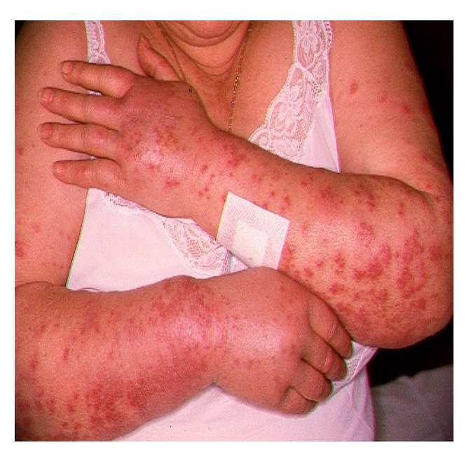
Figure 1. Papulonodular manifestations in our patient, following therapy with hydroxychloroquine (HCQ) (400 mg/day).

doses, an abrupt onset of painful papulonodular skin lesions occurred on her upper limbs (Figure 1), which was associated with general malaise and fever (T = 38.5 °C).