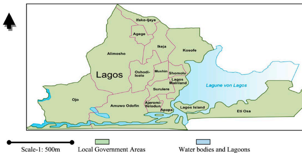
Figure 2. Map of Lagos metropolis.

A multistage sampling technique was used for this study. At stage one, the 20 Local Government Areas in Lagos State were stratified into three strata based on their senatorial districts. At the second stage, three Local Governments were randomly selected by balloting each of the Senatorial Districts. At the third stage, 47 waste collection centres across the randomly selected Local Government were purposively selected based on the volume of their waste deposit. At the fourth stage, 10 workers from each of 47 purposively selected waste collection centres were given questionnaires. However, only 339 responses were received back from the sampled population. The responses gathered were classified under the following variables of performance metrics for waste management in the state.