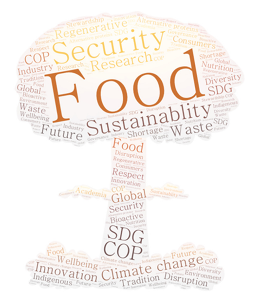
Figure 2. A simplified pictorial of the independent components that interact when considering food sustainability and security. In particular, there is a dependency on supply chain, processing and production systems in reducing waste generation in order to protect the environment for the future.

The environmental impact of food waste is considered a high priority from a governmental policy framework as it contributes to greenhouse gas emissions, as decomposing food releases methane in landfills. The FAO has reported that the carbon footprint of food waste could be as much as 3.3 billion tons of carbon a year, having a significant effect on the levers of climate change [5]. The impact of high levels of food waste on sustainability and resource use cannot be underestimated, especially in the food production and processing industries, which consume resources including water, land and energy. As such, this waste production exerts economic implications as loss of resources invested in production, transportation and distribution. It affects profitability for businesses and can lead to increased costs for consumers as well as food scarcity [3,4].