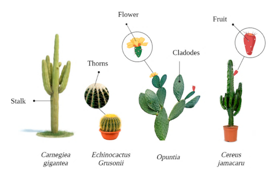
Figure 1. Morphological diversity of the main cactus species.

The hardiness of cacti is mainly due to their crassulacean acid metabolism, known as CAM, which favors the efficient use of water, fixing carbon dioxide ( CO_2 ) with phosphoenolpyruvate (PEP-carboxylase) during the night when water losses through transpiration are minimal [18] (Figure 2). This accumulation of organic acids in vacuoles overnight can reduce leaf water potential and maximize water uptake and storage, and also prevent the exchange of internal CO_2 with the external atmosphere.