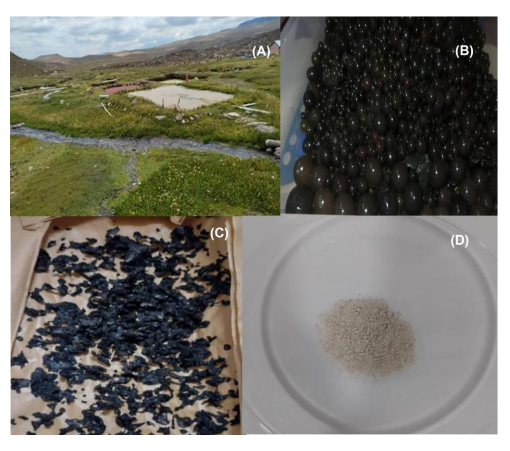
Figure 2. This collection site ( A ), sample of collected cyanobacteria ( B ), subsequently dried ( C ) and macerated ( D ).

Under laboratory conditions, the algae were initially identified as N. sphaericum (Figure 2B), according to the classification key described by Bornet and Flahault [23], which is integrated into the classification system [24]. For the identification of Nostoc sphaericum , the Geitler taxonomic key [25] and the Guiry classification system [26] were used.