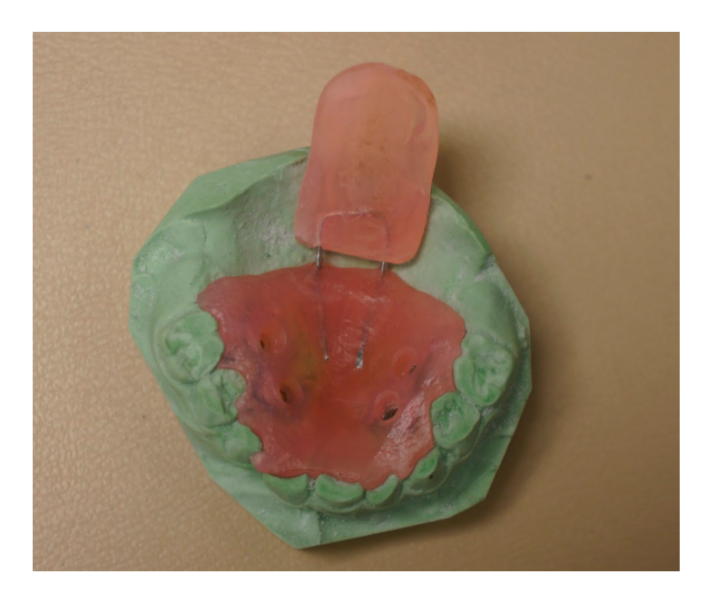
Figure 1. PPS fabricated from a dental impression.

The PPS has to be molded preoperatively by the Orthodontics department of our institution. Acrylic resins (Figure 1) were used. After the surgical procedure (either a pharyngeal flap or a secondary palatoplasty) had been completed, the PPS was placed over the palate to ensure a proper fit. The optimal PPS would cover the hard and soft palate along with an extension to protect the pharyngeal flap whenever necessary (Figure 2). If the posterior extension of the PPS was too long it would be sharply fashioned in the operating room and re-applied. Once adequate dimensions were obtained, the PPS was secured rigidly to the hard palate with a 4 screw fixation (Figure 3).