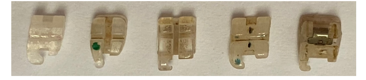
Figure 2. 20/40<sup>TM</sup> Brackets, Vapor<sup>TM</sup>, DynaFlex<sup>®</sup>, ClearViz + Mini and QuicKlear<sup>®</sup> III<sup>®</sup> brackets after 14 days of immersion in the coffee solution.

Among all brackets and all solutions, only Vapor<sup>TM</sup> and Chic. brackets showed satisfying and clinically acceptable color stability after 14 days of immersion in Coca-Cola ( \Delta E^* < 3.7 ).