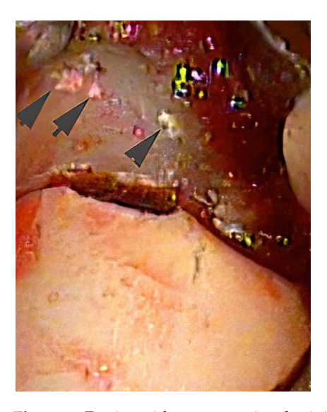
Figure 2. During videoscope assisted minimally invasive surgery (VMIS), multiple areas of residual calculus (arrows) are noted to remain after SRP. The position of the calculus is in an area of deep pocket probing depth and would be very difficult to access during blind SRP. (Videoscope photo 40 \times magnification).

In most cases where SRP is not successful in controlling inflammation, clinical experience indicates that there is usually subgingival calculus present that has not been removed. Figures 2 and 3 show areas of residual subgingival calculus remaining after SRP that was performed on an anesthetized patient by a periodontist. Because most sulcular inflammation is associated with calculus, it is necessary to remove the residual calculus with advanced therapy [10,30]. Advanced therapy can range from the use of enhanced non-surgical visualization with an endoscope or videoscope to surgical access. Both the use of enhanced visualization or surgical access are aimed at improved visualization for the removal of residual calculus. The surgical removal of calculus may be an initial step in a procedure aimed at regeneration of lost periodontal tissues. However, for a successful regenerative procedure it is necessary to have a calculus free root surface to prevent a return of inflammation [20,30]. The studies showing that calculus may represent an alternate pathway from plaque that leads to epithelial cell death gives further weight to the necessity of removing all calculus [31–33]. The use of chelating agents for root modification and the removal of microislands of calculus may be a further necessary step beyond current routine surgical and non-surgical methods [20].