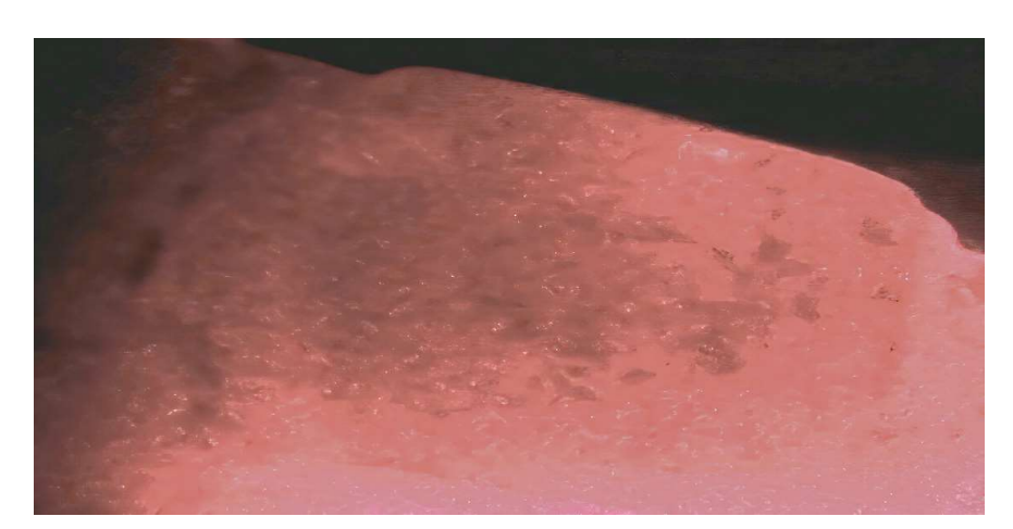
Figure 1. Microislands of calculus remaining on a root surface after ultrasonic and hand scaling until the root of the extracted tooth was deemed calculus free when visualized with 3.5 \times magnification loupes. The root surface is illuminated with a 655 nm laser to aid visualization of calculus. (Videoscope photo 40 \times magnification).