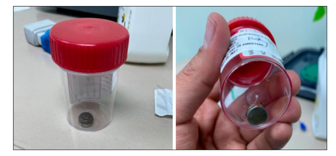
Figure 2. Foreign body (Button battery Silver-oxide type) immediately after removal.

or follow-up, but a social worker contacted the father via hospital phone to check in on the child and he responded that there was no need for follow-up because the child was doing well.