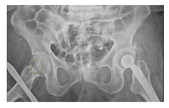
Figure 1. Radiography of pelvic bone. A needle fragment showed in the right groin (yellow circle).

gas analysis (ABGA) to monitor the patient's state of acidosis, we repeatedly performed puncture of the right femoral artery instead of the radial or dorsal artery. We used a 25 gauge and 16 mm length needle for femoral arterial puncture. After blood extraction, while drawing the syringe out of a femoral artery, the needle was disconnected from the syringe. The needle remained in the groin of the patient, and its location was not identified through portable ultrasonography. Radiography of the pelvic bone showed the needle fragment in the right groin (Figure 1). Fluoroscopic radiography revealed the exact location of the needle fragment (Figure 2). A surgical incision was performed to obtain the embedded needle in the soft tissue of the groin, without penetrating the femoral artery. The needle fragment was removed (Figure 3) completely without complications. The needle was bent as it was pulled out with mosquito forceps (Figure 3).