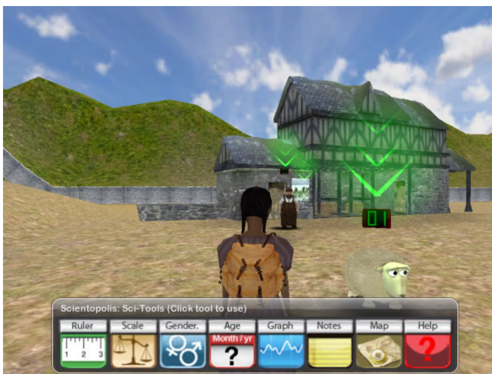
Figure 2. Scientopolis: the SAVE Science world.