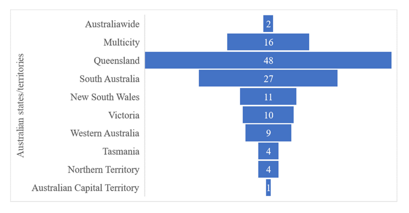
Figure 2. Geographic variability of the number of studies across Australian jurisdictions. Multijurisdictional studies were included in all relevant jurisdictions.

Half of the articles (n = 66; 51%) included in this review were for studies that included temperature and health data from Queensland. Two of these were Australia-wide studies and 16 were multi-city studies. Almost all of the studies (n = 65) included Brisbane—the capital city of Queensland (Figure 2). Four articles covered data from across Queensland [29–32], three articles focused on other major cities of South East Queensland, including the Gold Coast and the Sunshine Coast [33–35], and four focused on regional towns, including Cairns, Townsville, Rockhampton, Mackay, Toowoomba, Mount Isa and Longreach [36–39].