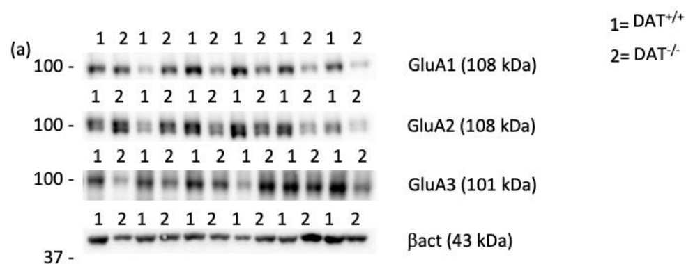
Figure S3. (a) Examples of full-size cropped immunoblots related to the expression levels of GluA1 (108 kDa), GluA2 (108 kDa), GluA3 (101 kDa) and βact (43 kDa) measured in the extra-synaptic fraction of medial prefrontal cortex (mPFC) of DAT +/+ and DAT -/- rats.