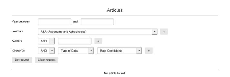
Figure 3. Query Interface for the bibliography associated with the numerical data. There is a search by year, journal, authors, and keywords. The search by keywords is possible because of the "keywords" metadata of Table 6.

The public interface of BASECOL has been simplified, and we describe here its current features. The "Home" section is the landing page for the URL: https://basecol.vamdc.org; it provides the citation policies and the units. There are two ways to query the database: a guided query with the "Browse Collisions" (see Section 4.1.1) section that corresponds to a simplified version of BASECOL2012 collisional query browser and the "Search Collisions" (see Section 4.1.2) that provides queries by several free search criteria. The "Search articles" section (cf. Figure 3) provides a search on the bibliographic entries which are associated with numerical data. The "Tools" section gives access to information on the SPECTCOL tool [4] and on a scientific package for the water-H<sub>2</sub> collisions [19–24]. The search on energy tables has been removed following recommendations from the French PCMI community<sup>18</sup>.