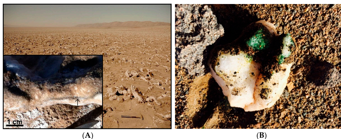
Figure 3. Endolithic and hypolithic lifestyles in deserts. (A) Salt crust in a playa in the hyperarid core of the Atacama Desert. Insert shows a magnification of one salt nodule with a layer of the pigment scytonemin, indicative of microbial colonization. (B) A hypolith in the Atacama Desert. The green area are cyanobacteria that live underneath the overturned quartz, sheltered from excess UV radiation and having more access to condensed water.

One strategy is to switch between dormant and active life stages, becoming active during rare rainfall events or when fog provides sufficient moisture. A recent study showed that microbial life became temporarily active after a rain fall event in the hyperarid core of the Atacama Desert [108]. But even without any rainfall, life can survive in this kind of desert. Most deserts are rich in salts, which accumulate due to the evaporation (or sublimation) of water. Some of these salts are hygroscopic, such as the common salt halite, which can attract water directly from the atmosphere. The affinity of the salts for moisture from the atmosphere can be so strong that sufficient water is absorbed to form an aqueous solution. That process is called deliquescence and is used by some microbes, especially cyanobacteria, as a means of survival [109] (Figure 3). In recent lab experiments, archaea survived and metabolized with 100% of water supplied only by deliquescence [110].