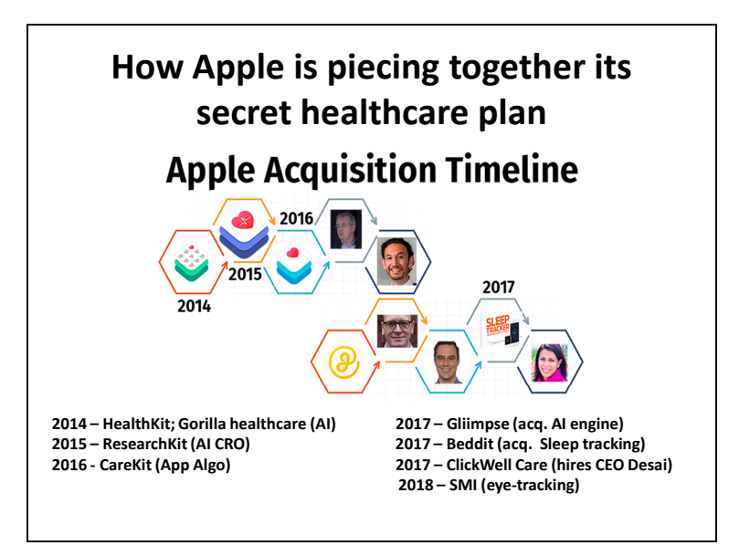
Figure 1. How Apple is piecing together its secret healthcare plan.