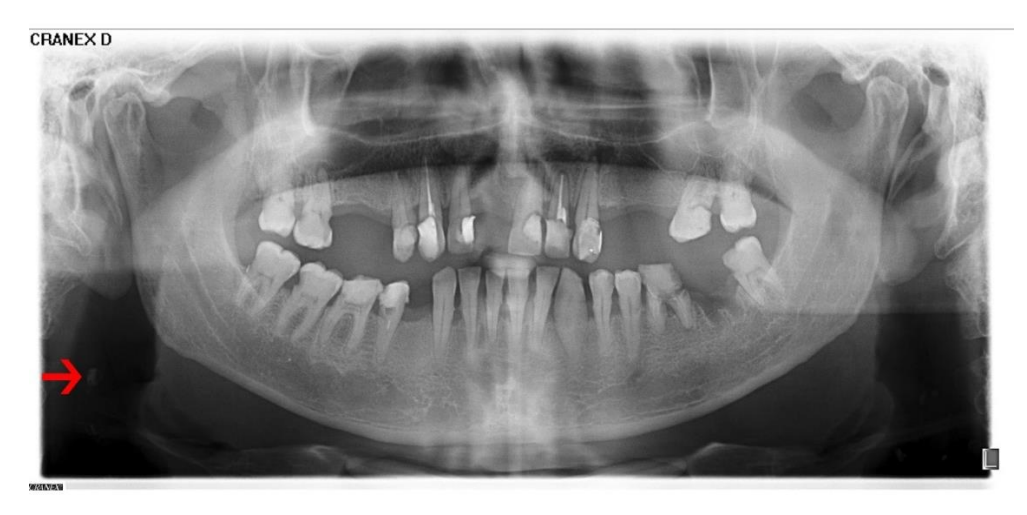
Figure 1. Panoramic radiograph with a detectable carotid artery calcification (red arrow).