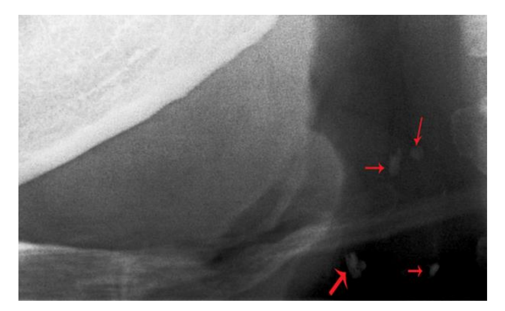
Figure 2. Close-up view of a panoramic radiograph showing the radio-opacities in the carotid vasculature. Red arrows indicate carotid artery calcifications.