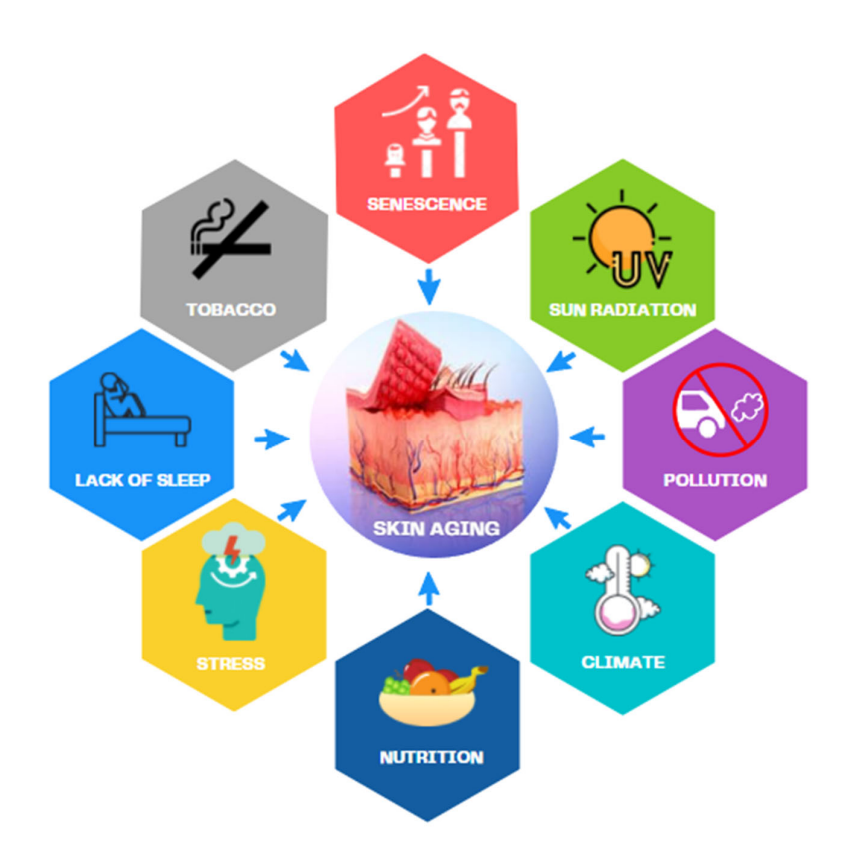
Figure 1. Driving factors of skin aging.