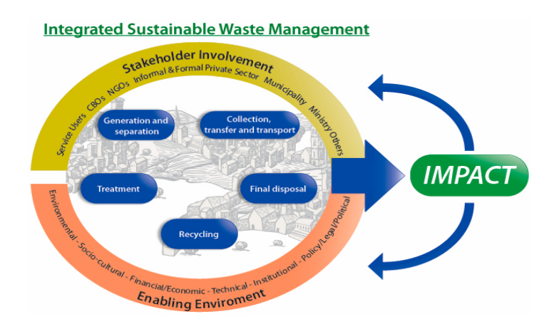
Figure 1. The Integrated Sustainable Waste Management Model [9-11].

The methodological approach used to develop the EPR system was based on the Integrated Sustainable Waste Management Model (ISWM) (see Figure 1), which considers the stakeholders, the material flow, and other issues grouped around technical, financial-economic, socio-cultural, environmental, institutional, and political/legal aspects that influence the full sustainability of waste management [9].