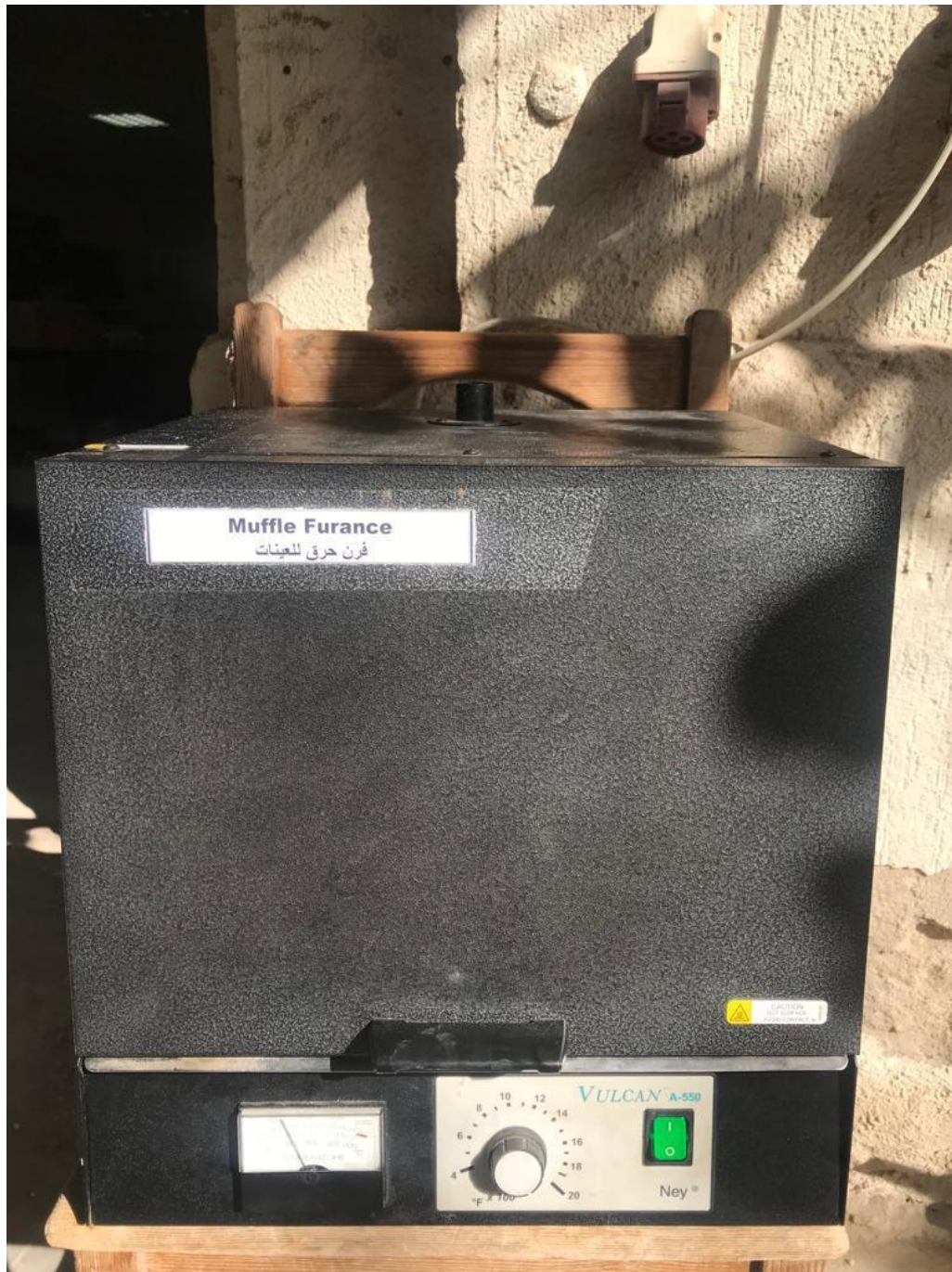
Figure S37: Sample specimen in heater