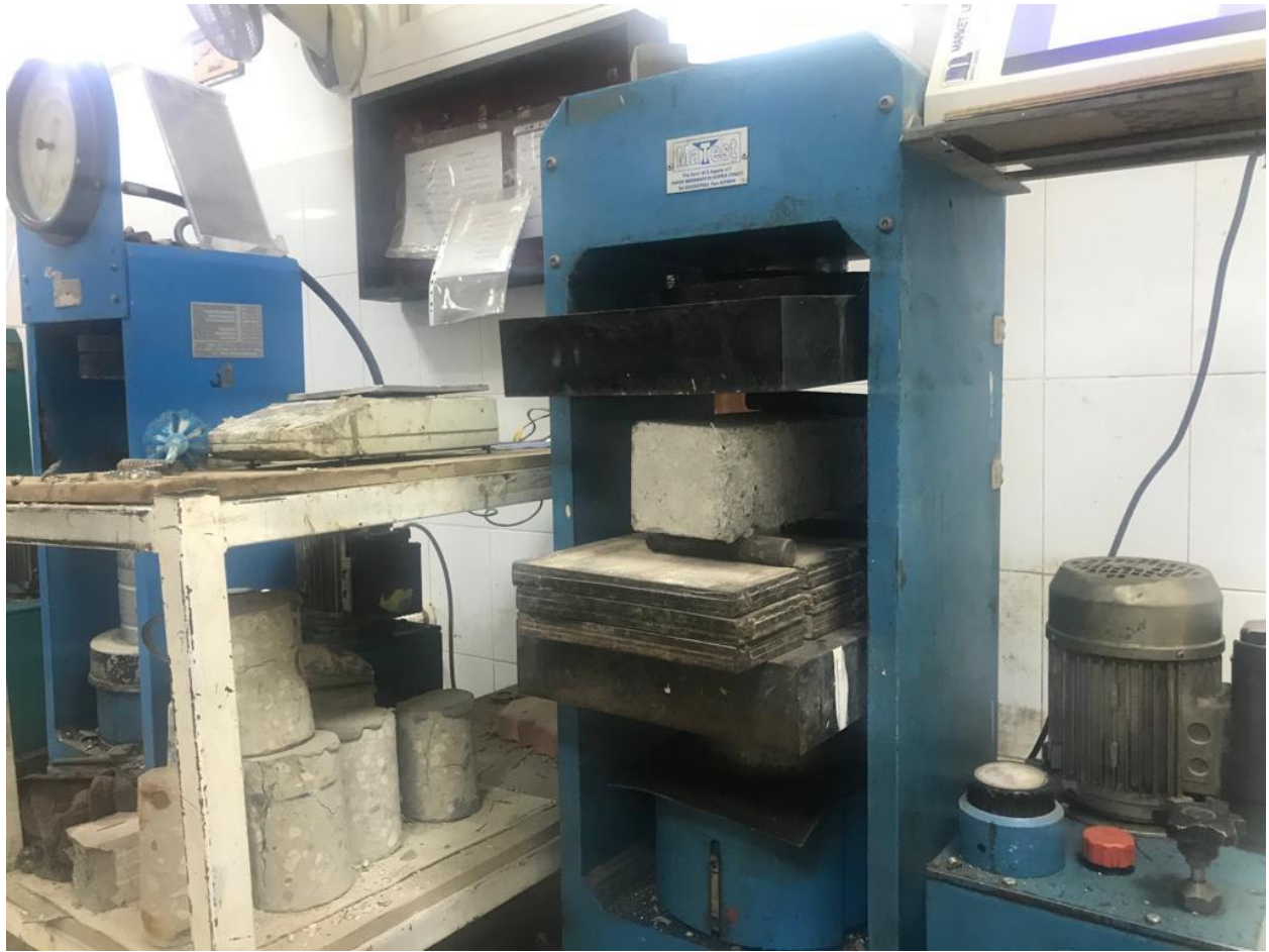
Figure S14: Sample flexural failure