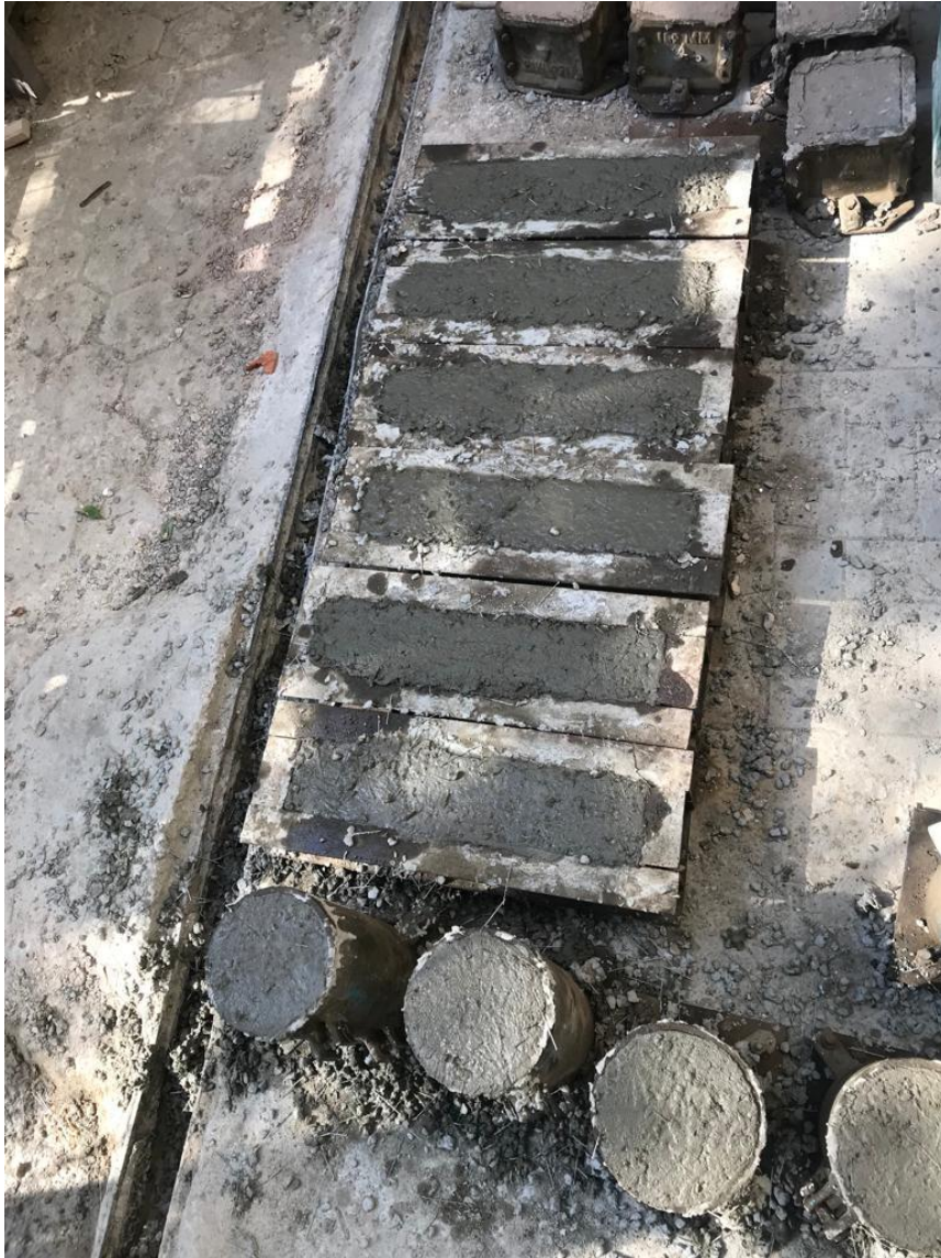
Figure S7: Flexural beam and cylindrical