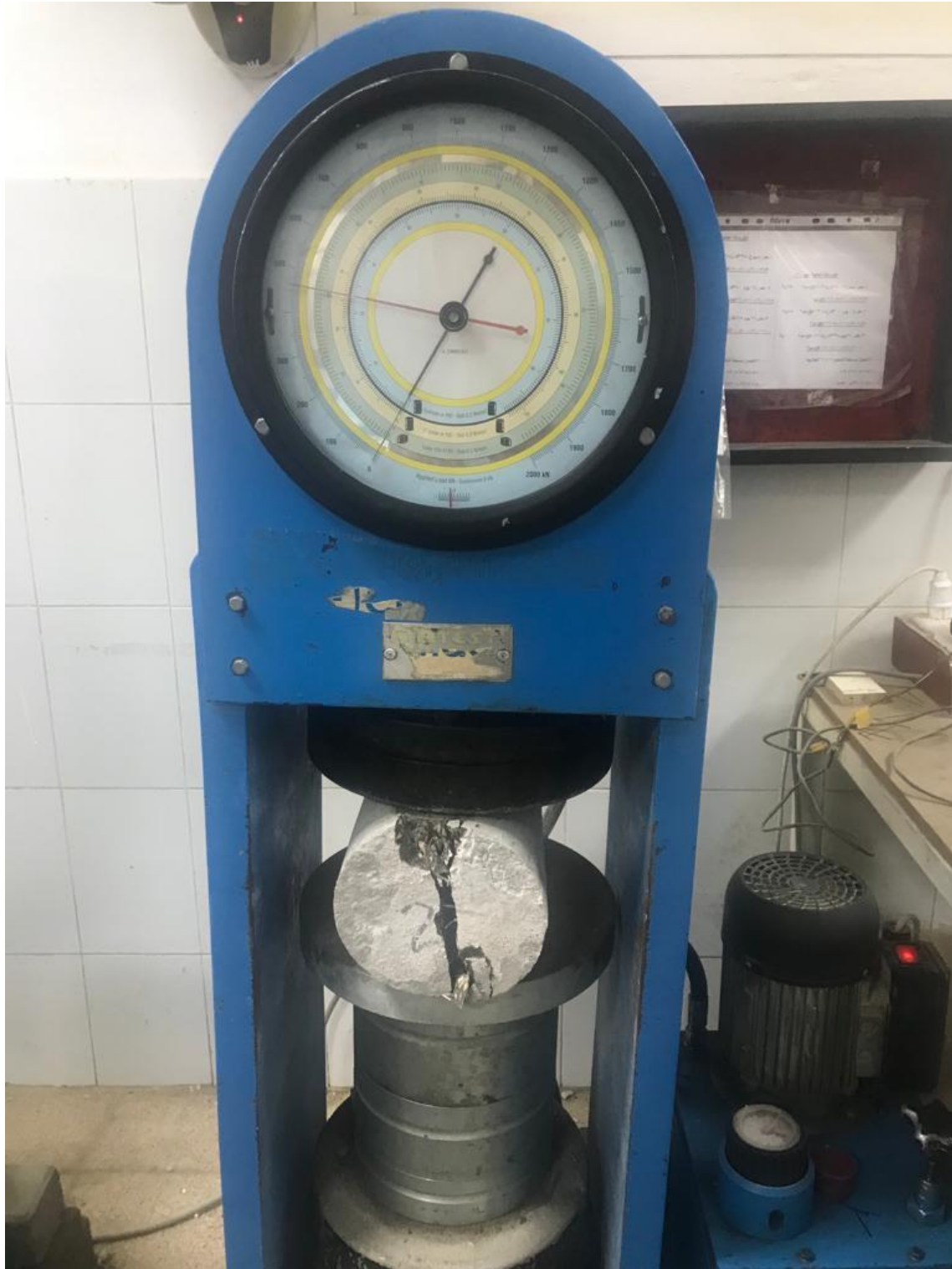
Figure S20: Sample tensile strength failure