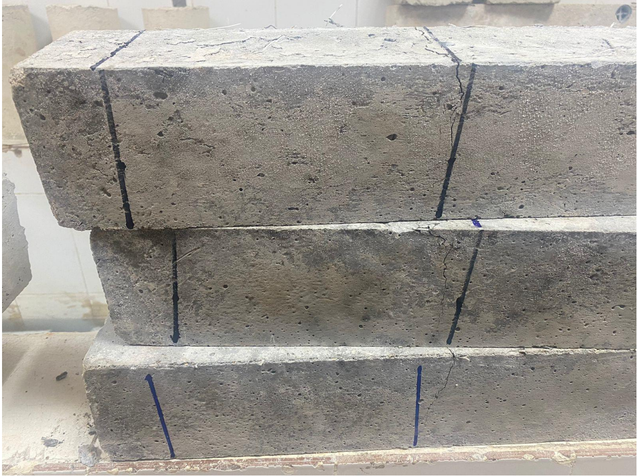
Figure S31: Sample flexural strength failure