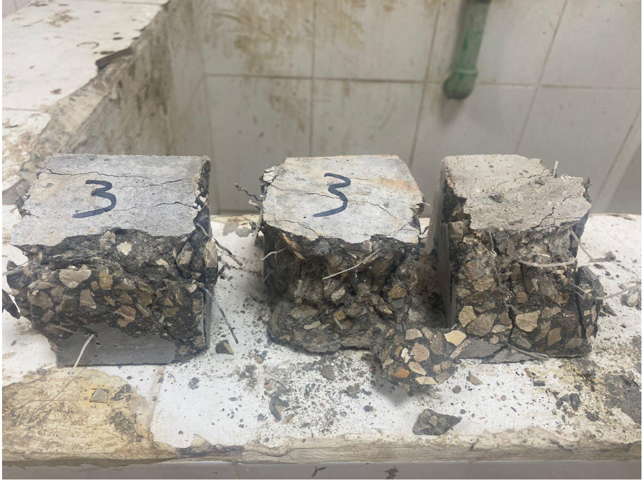
Figure S25: Sample compressive strength failure