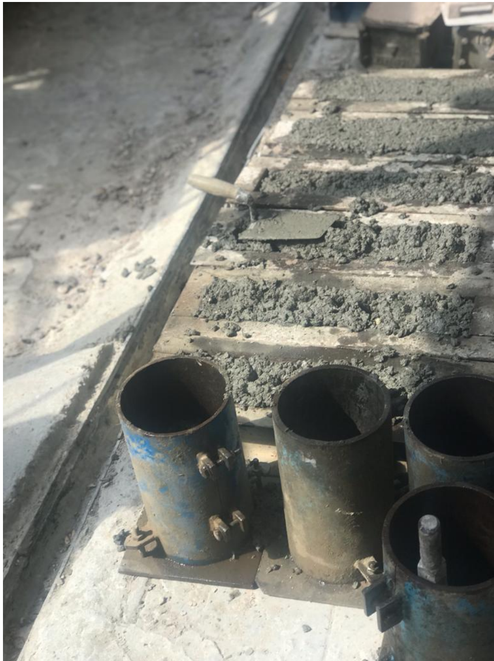
Figure S6: Preparation of different Mixes