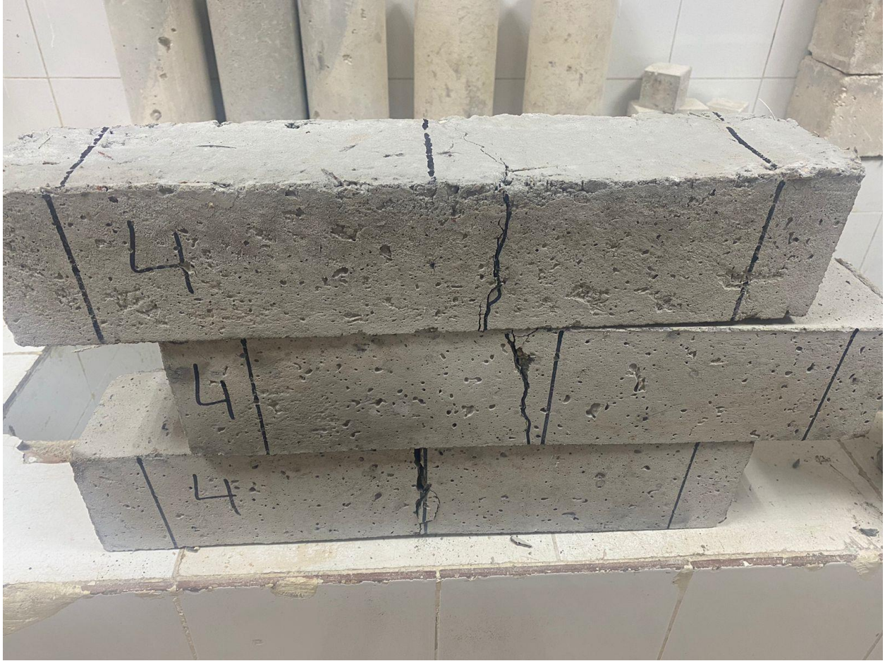
Figure S28: Sample flexural strength failure