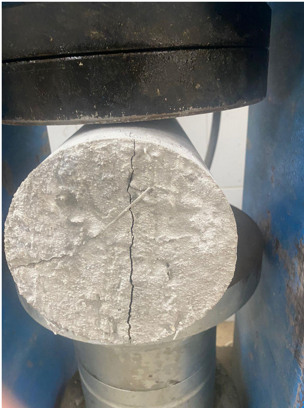
Figure S27: Sample tensile strength failure