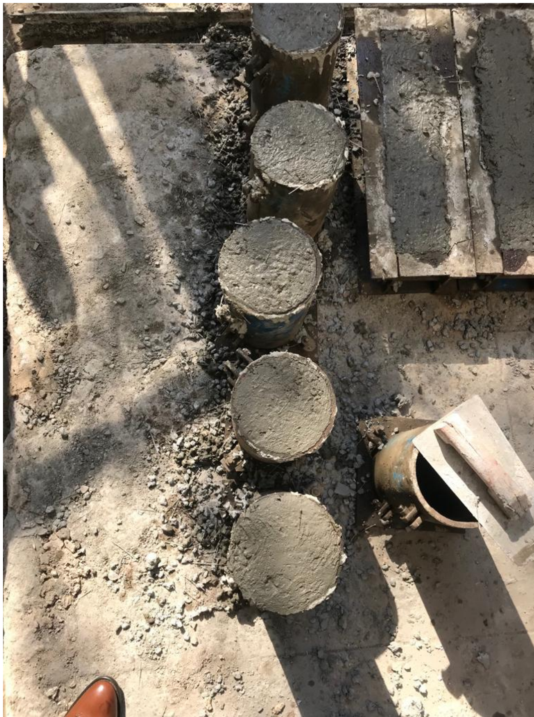
Figure S8: Flexural beam and cylindrical