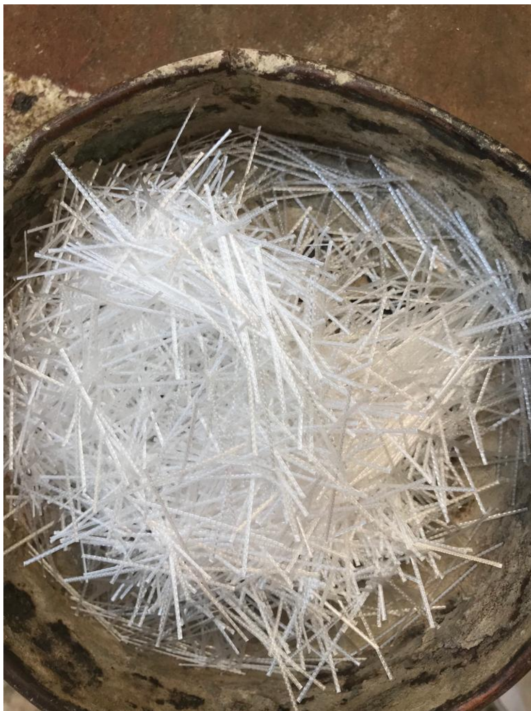
Figure S3: Shape of Polypropylene Fiber