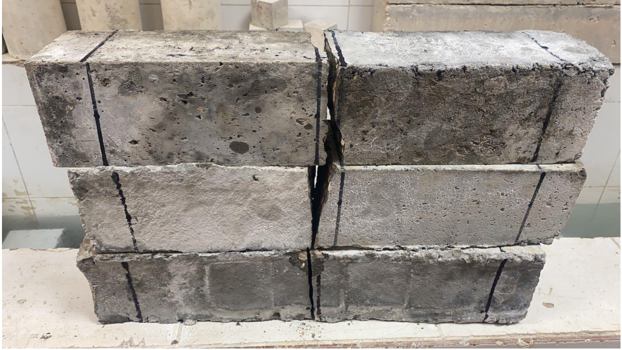
Figure S17: Sample Flexural strength failure