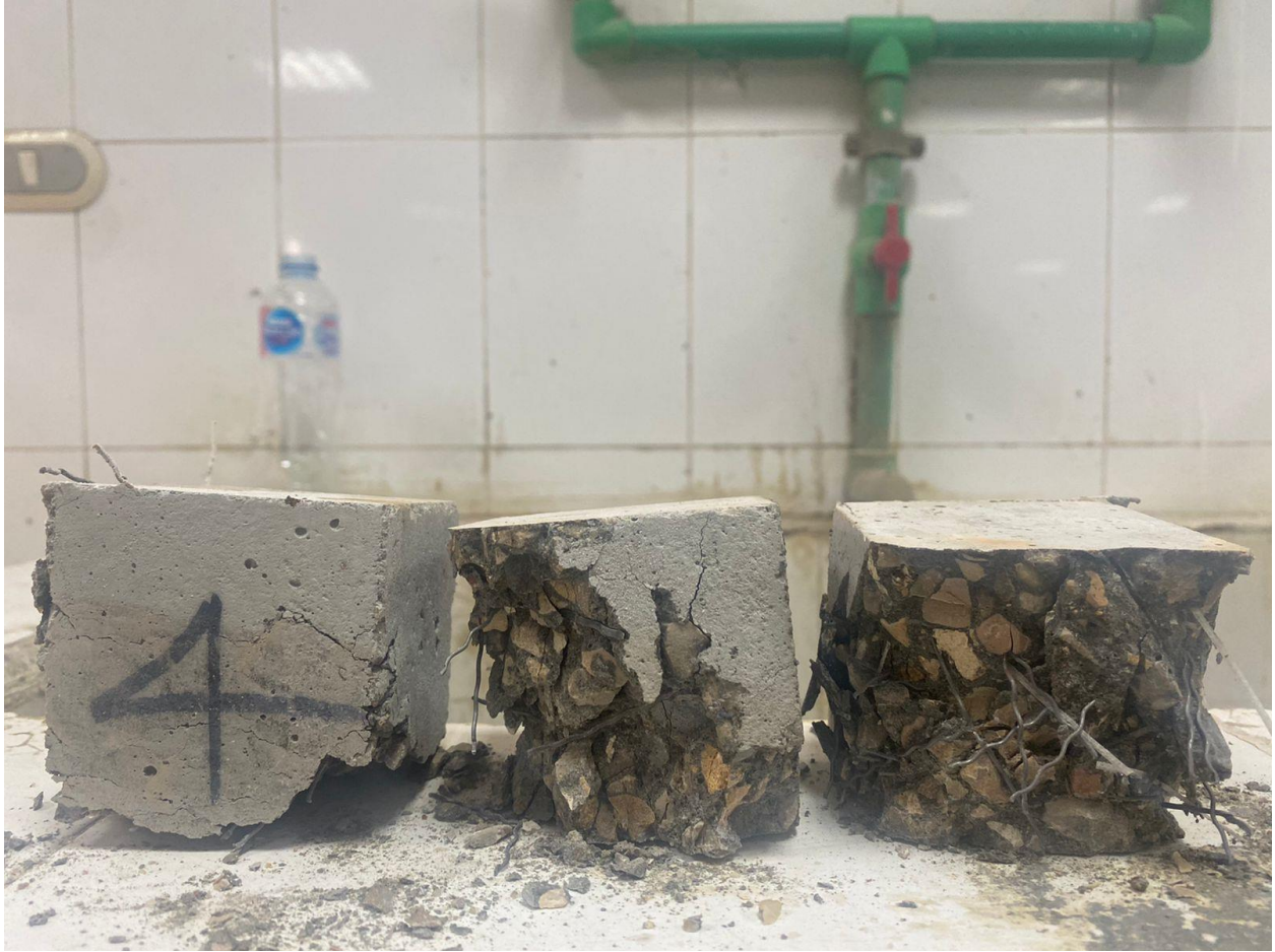
Figure S33: Sample compressive strength failure