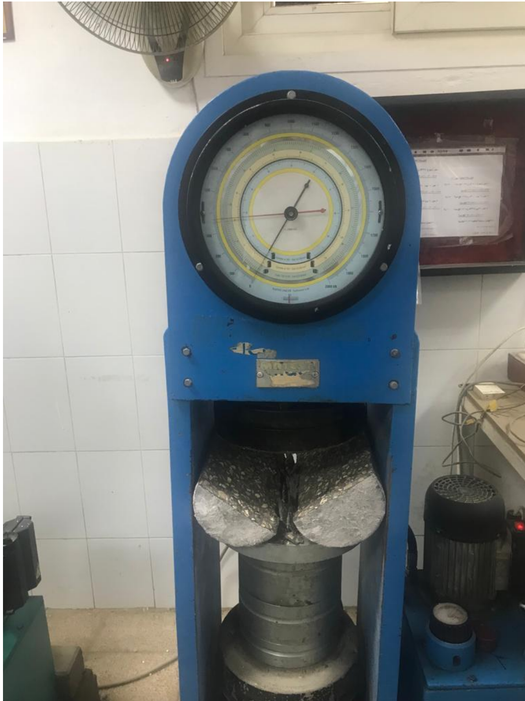
Figure S11: Test setup for tensile strength