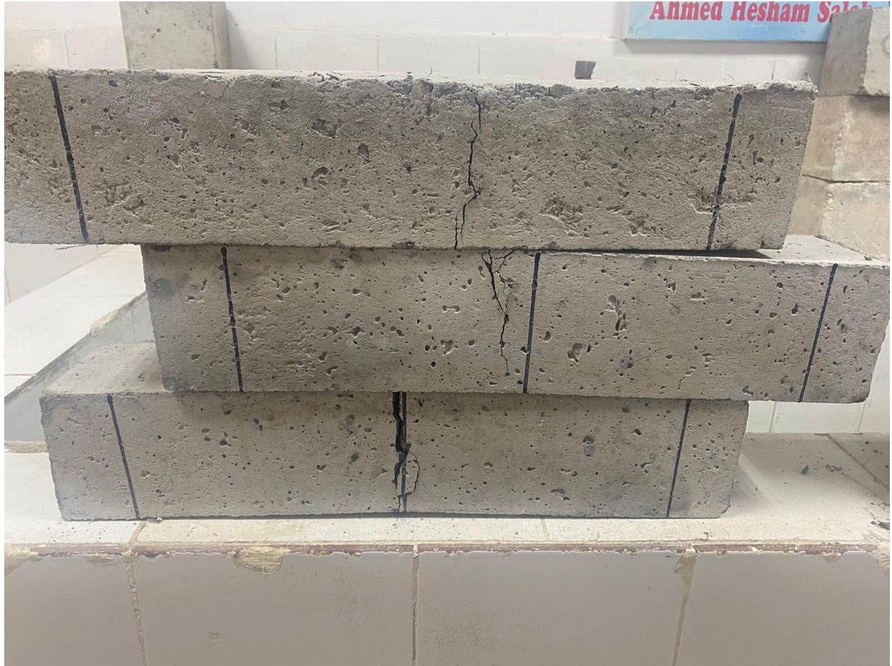
Figure S30: Sample flexural strength failure