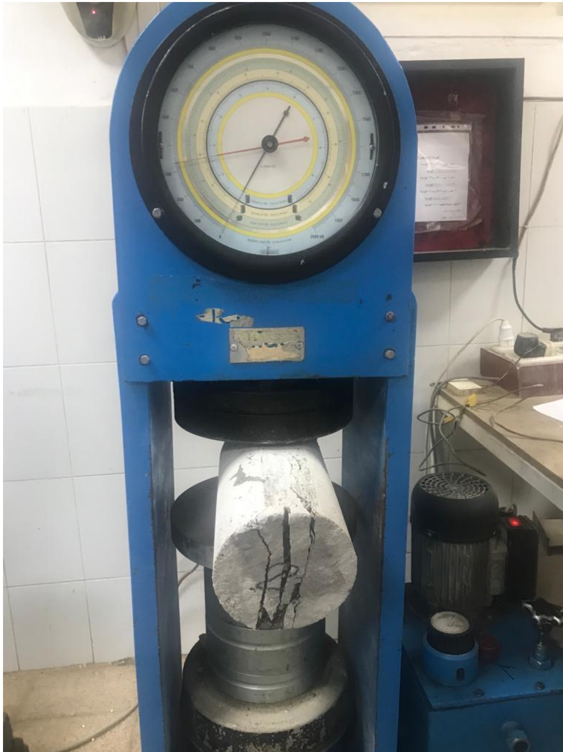
Figure S22: Sample tensile strength failure