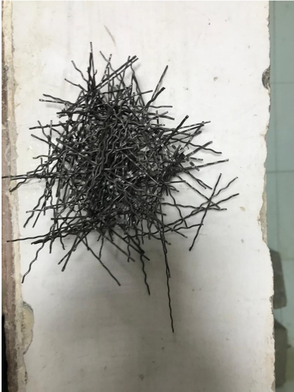
Figure S2: Shape of Steel Fiber