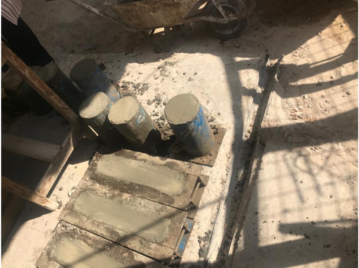
Figure S4: Flexural beam and cylindrical