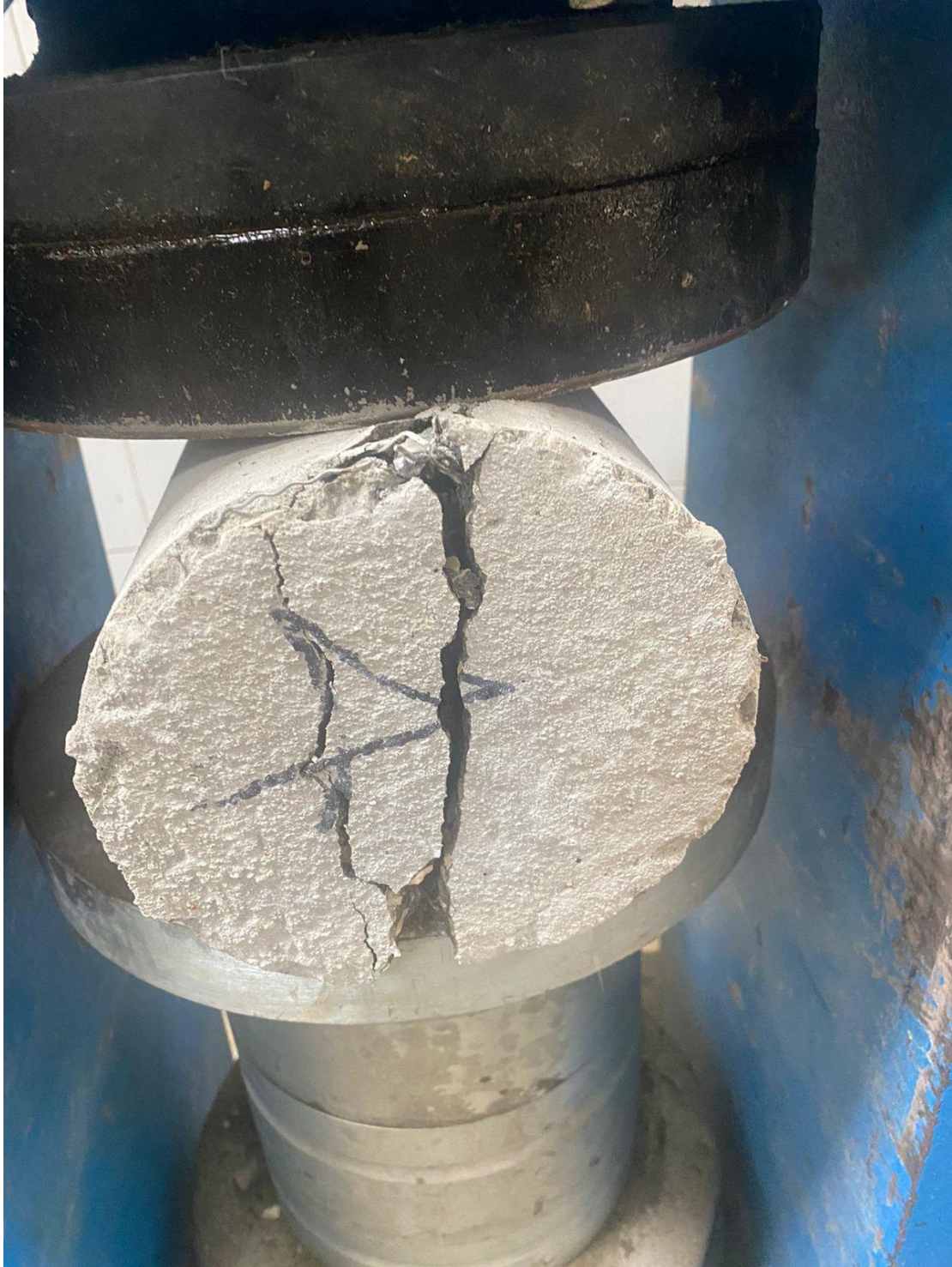
Figure S29: Sample tensile strength failure