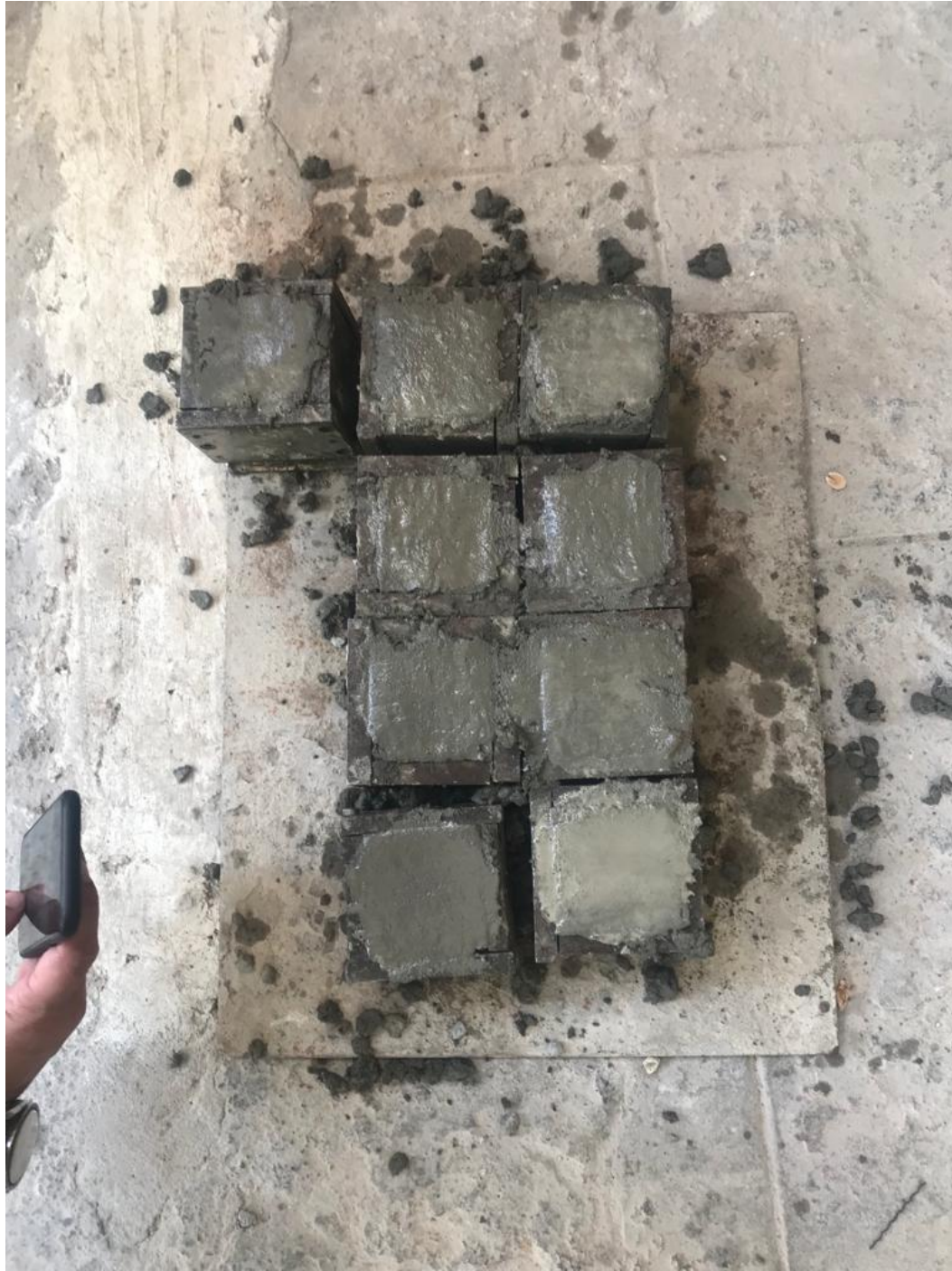
Figure S10: Preparation of compressive cubes