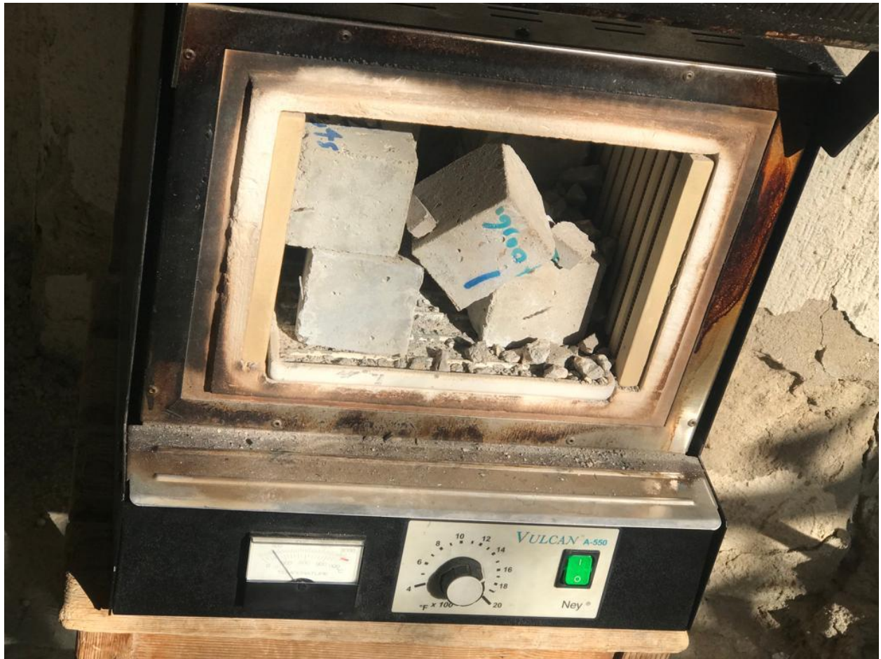
Figure S35: Sample specimen in heater