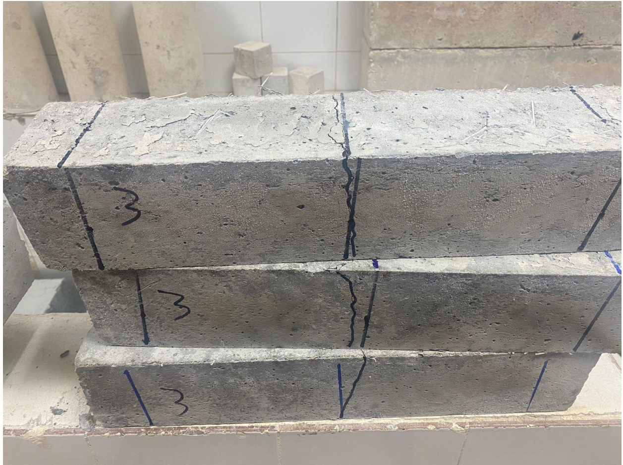
Figure S24: Sample flexural strength failure