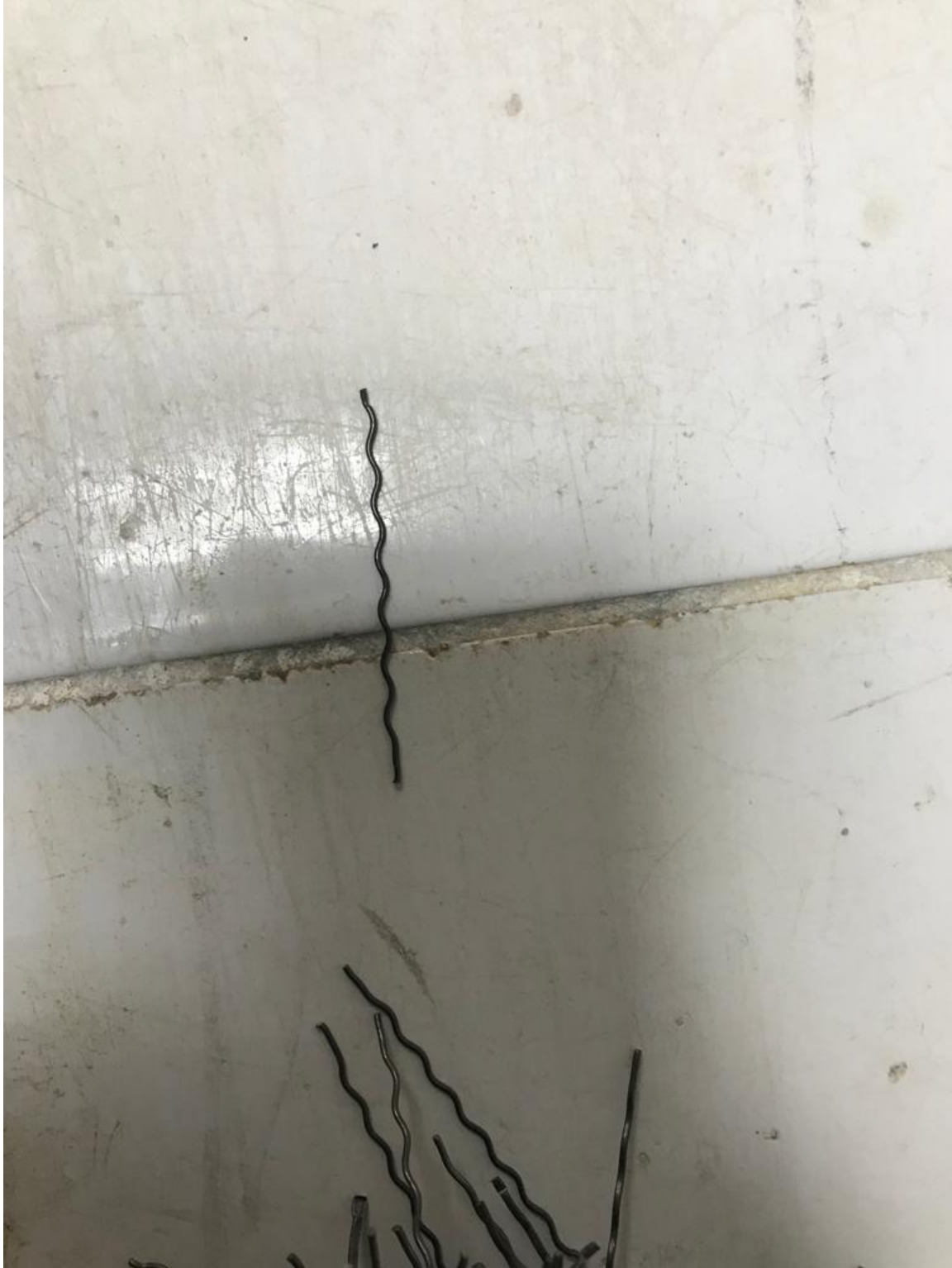
Figure S1: Shape of Steel Fiber