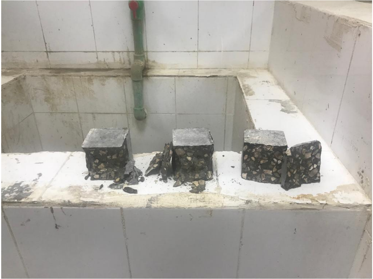
Figure S15: Sample compressive strength failure