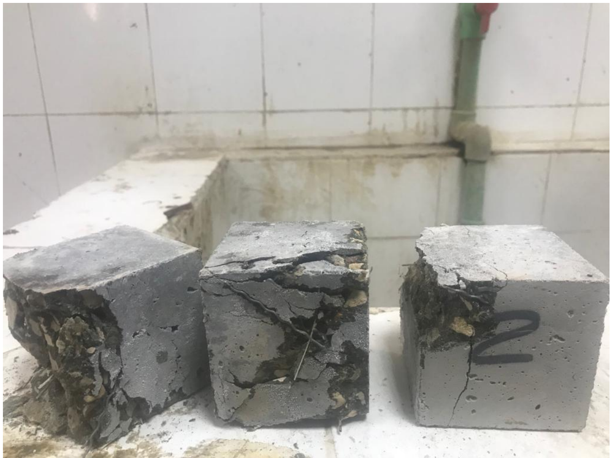
Figure S19: Sample compressive strength failure