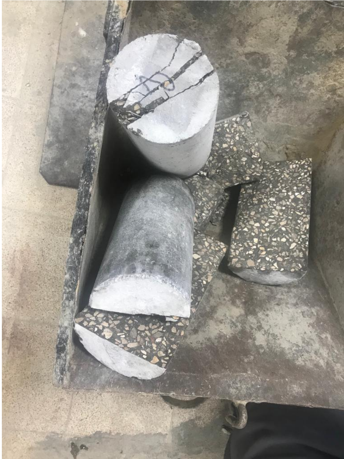
Figure S21: Sample tensile strength failure