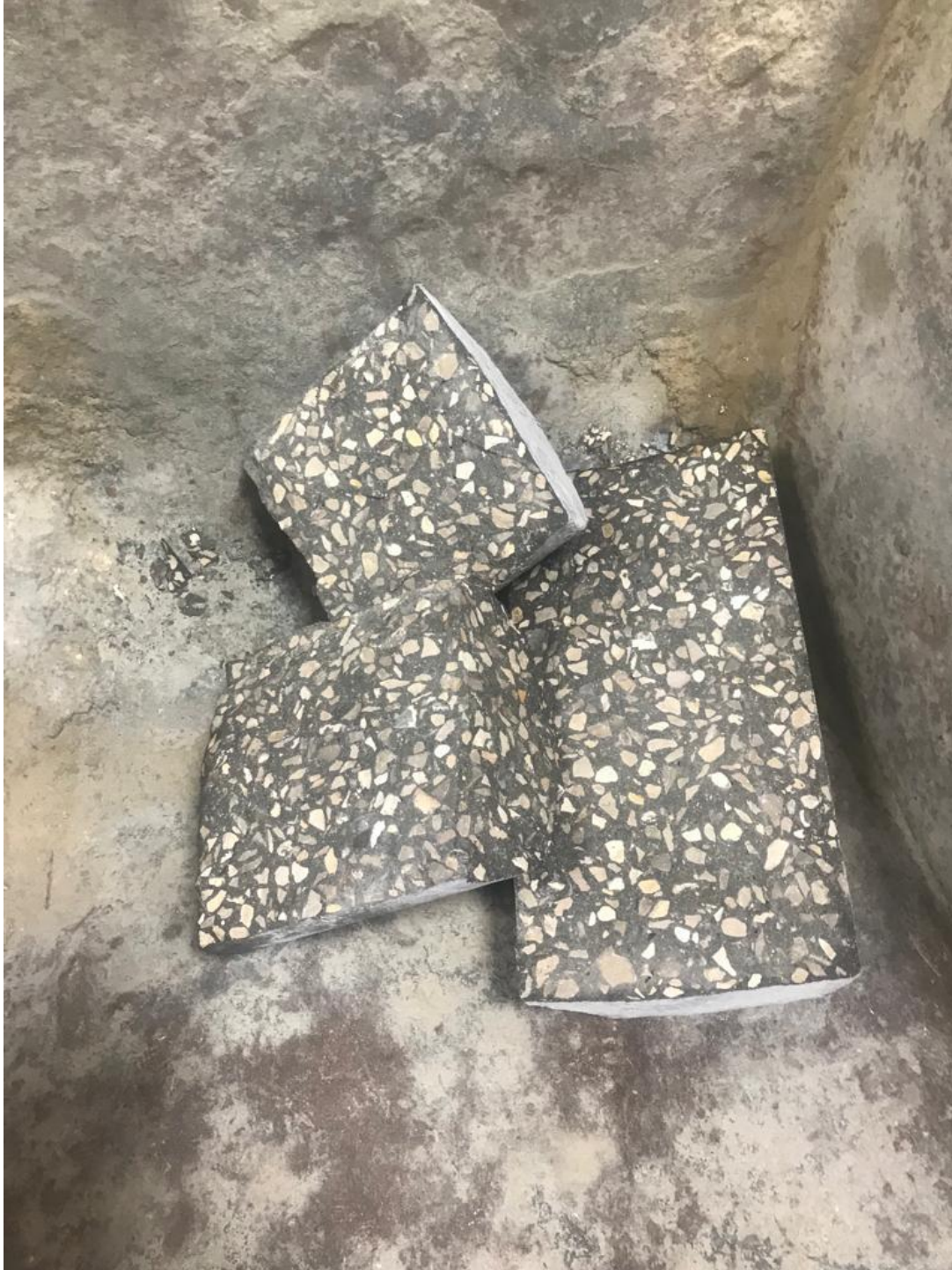
Figure S13: Sample tensile failure