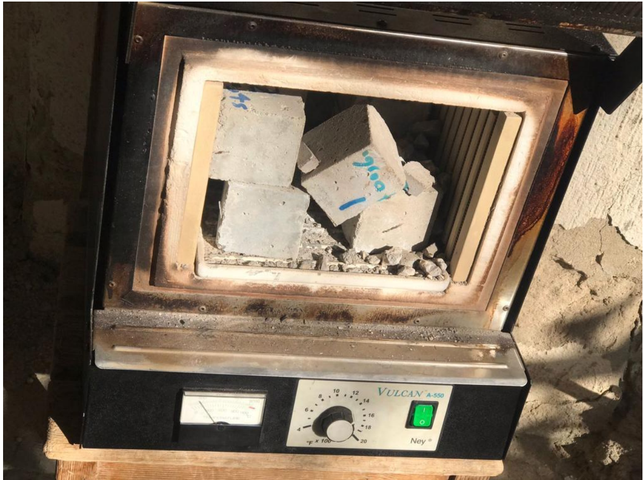
Figure S34: Sample specimen in heater