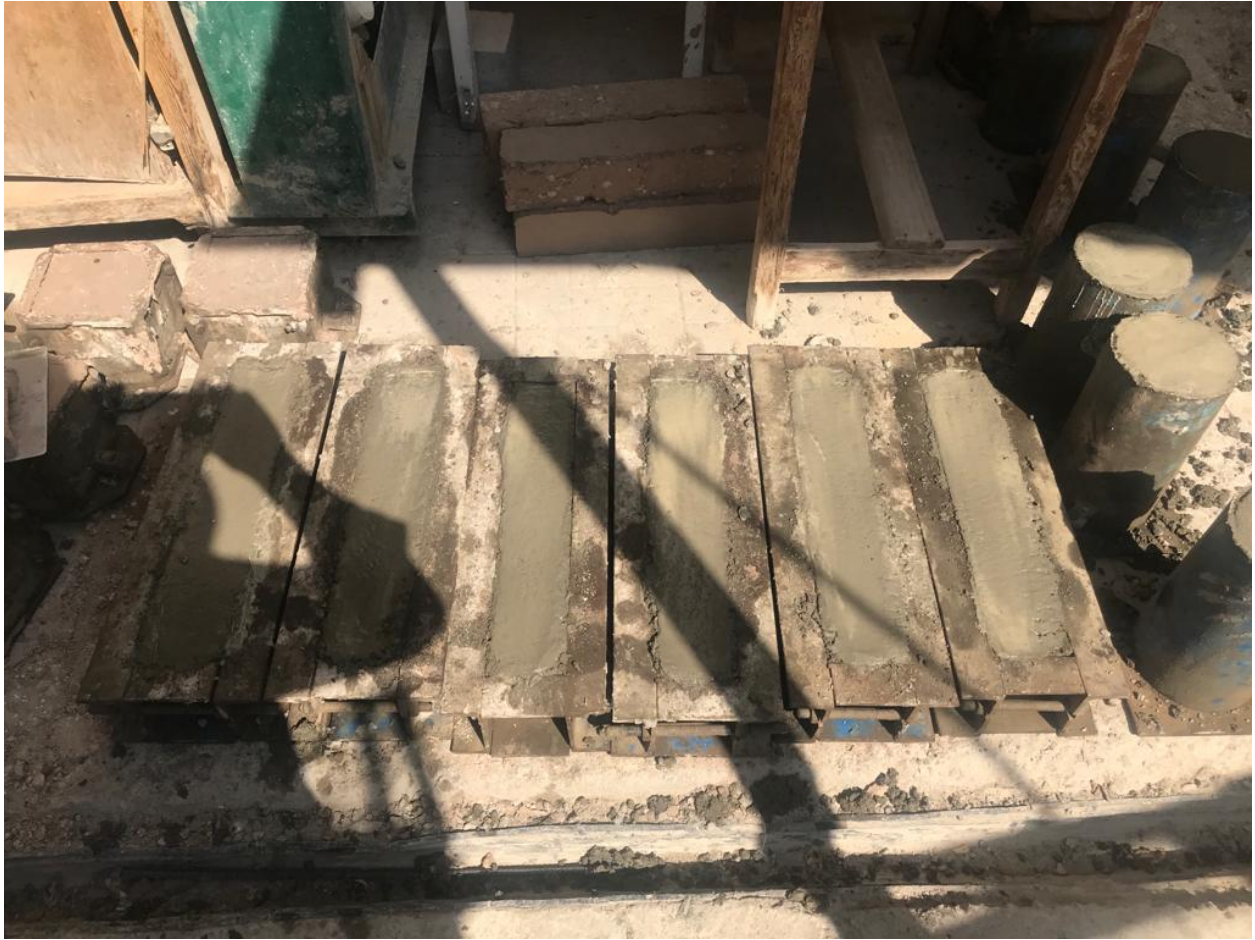
Figure S5: Flexural beam and cylindrical