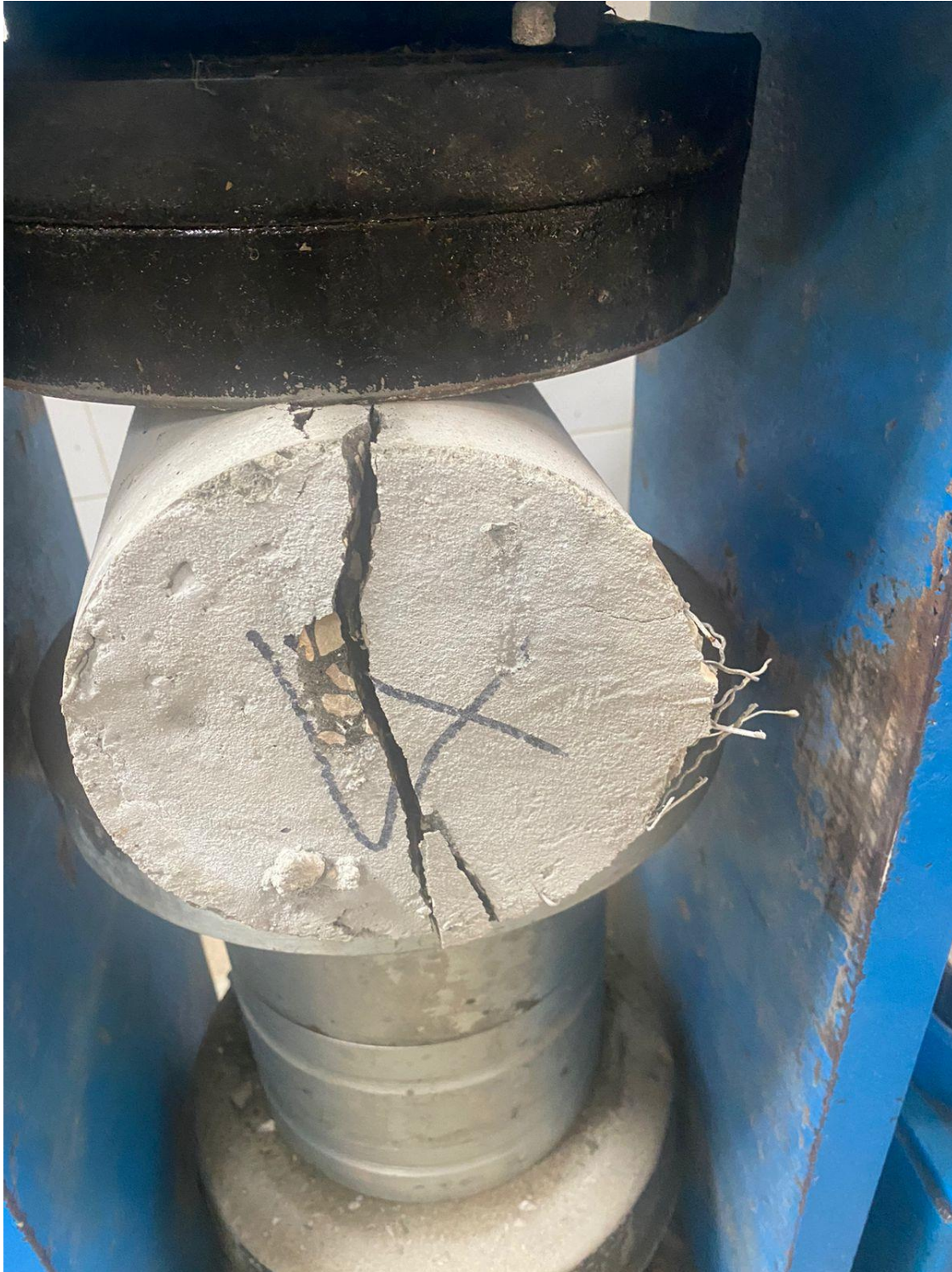
Figure S26: Sample tensile strength failure