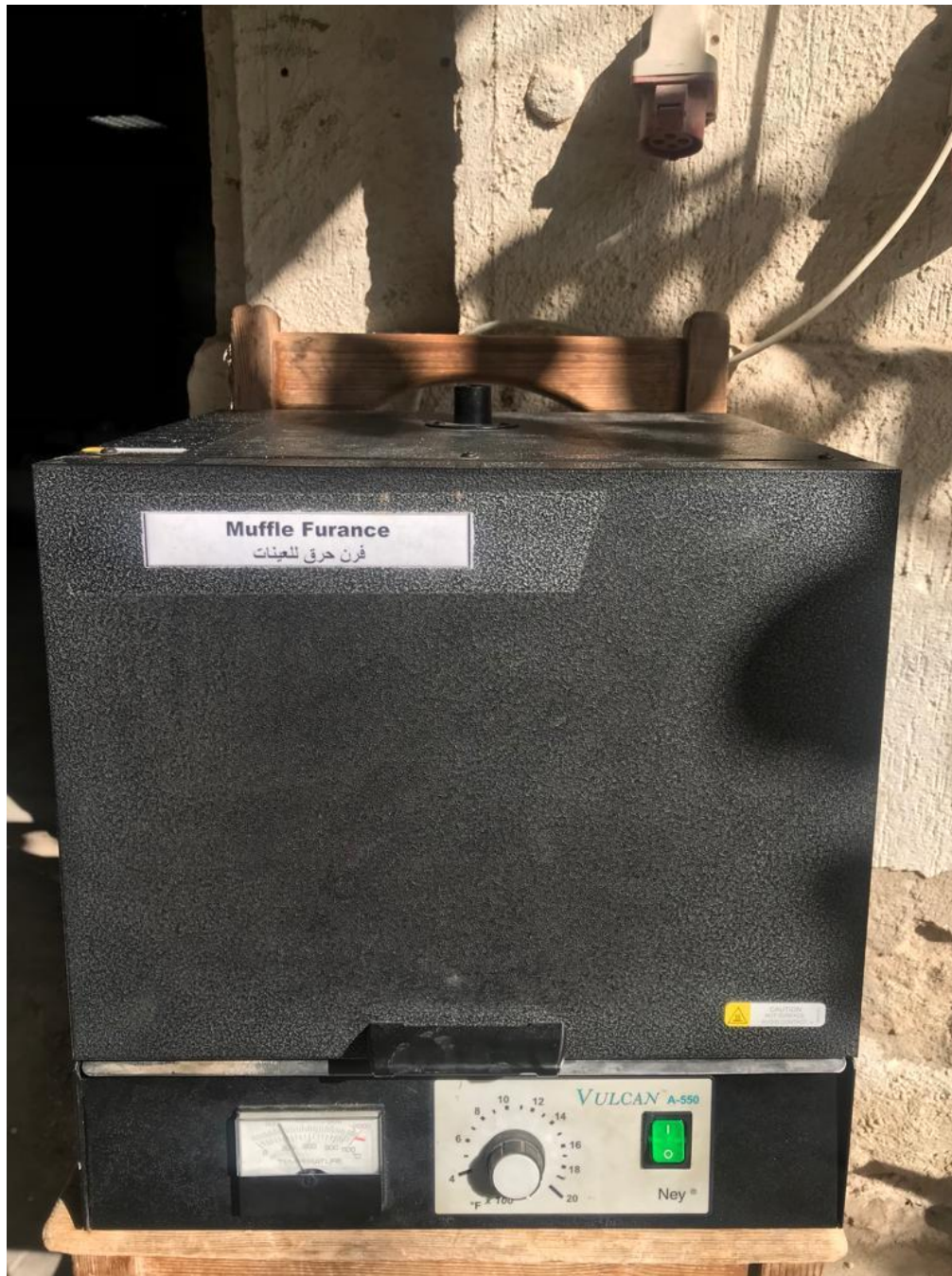
Figure S36: Sample specimen in heater