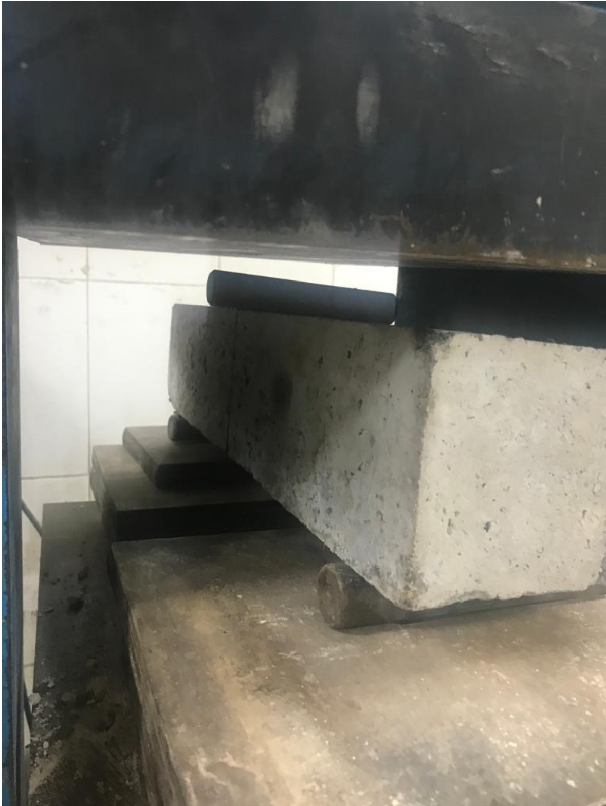
Figure S12: Test setup for Flexural strength