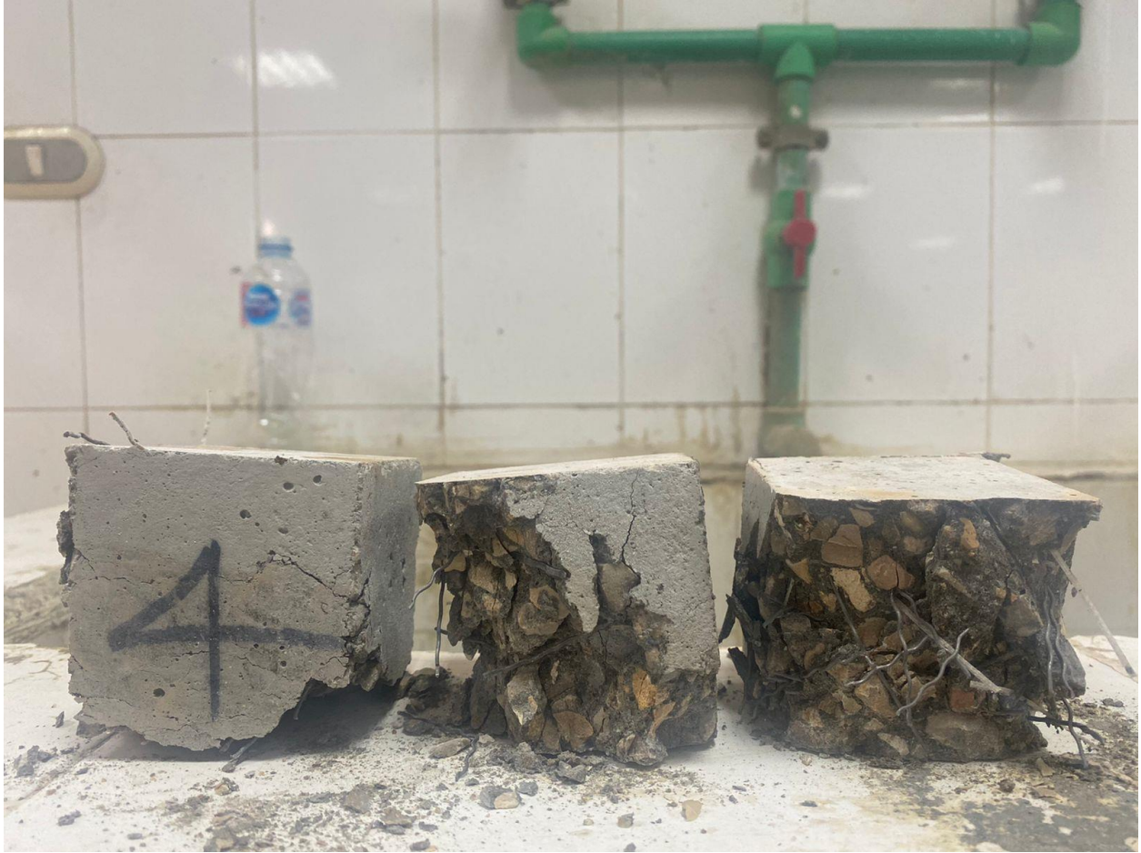
Figure S32: Sample compressive strength failure