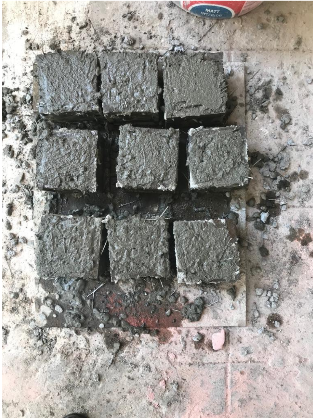
Figure S9: Preparation of compressive cubes