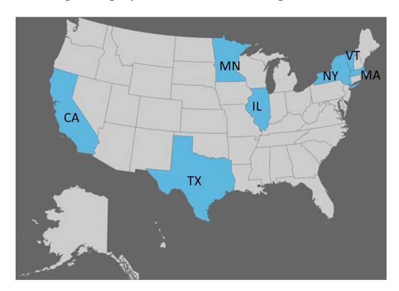
Table 1. (a) Demographic and electricity system profile of each state. (b) Renewable Generation and Percent Electricity from Renewables does not include nuclear generation but does include large-hydropower. Sources: U.S. Energy Information Administration 2013 [31], Sherwood 2012 [28], NREL 2012 [27].

Figure 1. Location of the seven states in comparative analysis. California (CA), Illinois (IL), Massachusetts (MA), Minnesota (MN), New York (NY) and Vermont (VT) all have different levels of smart grid deployment and renewables penetration.