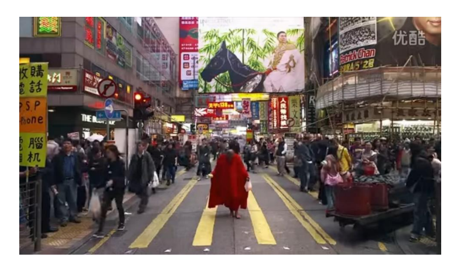
Figure 2. Self-reflexive performativity on a pedestrian crosswalk.

In the spirit of the Kinhinki , which warns its readers to "not drift into the bustle of the practices of another family," Walker proposes an alternative to the hectic immoderations of modern life by approaching the conventional standards of walking meditation with creative fidelity (Riggs 2008, p. 233). Where the rule of looking ahead aimed at fostering meditative focus, Tsai's walker squarely casts his gaze downward, oblivious to the countless advertisement posters, signboards, and digital screens bespeaking consumerist distraction. With a touch of self-reflexivity, the shot of him on Mongkok's Sai Yeung Choi shopping street—a permanently pedestrianized street when the film was made in 2012—shows him performing kinhin specifically on a crosswalk (see Figure 2). In this way, the film "focuses on the ground" and "discloses the hustle and bustle of the city [in] counter-consciousness to this business" (Finnane 2016, p. 127). Further, where Menzan's admonition to "go straight ahead and return straight" directly opposed the Obaku ritual of circumnavigating effigies of the Amida Buddha, the walker roams across Hong Kong without any obvious agenda or destination (Riggs 2008, pp. 234, 243). In sharp distinction to the busy, purposed pacing of other pedestrians, the walker's aimless kinhin evokes the levity of the proto-Zen Zhuangzian sage who "wanders free and easy in the service of inaction" (Watson 2013, p. 50).