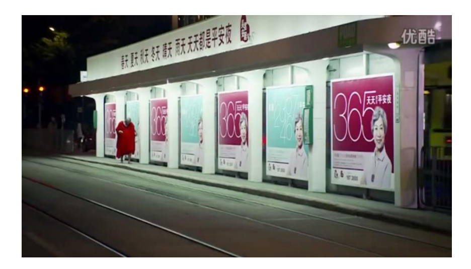
Figure 4. Spring, summer, autumn or winter, rain or shine—every day can bring a peaceful night.