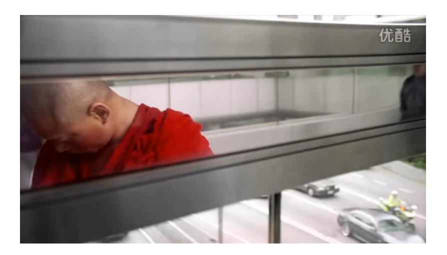
Figure 9. A window of reflection.

Having traversed the myriad terrains of the city, the walker's journey finally comes to a stop in the penultimate shot. Flanked by two stacks of undelivered newspapers that signal an impending dawn, he finds himself halted in front of firmly-locked metal grills. To the extent that the walker's journey hitherto this point has partaken in the toils and travails of modern life, his stopping before a "NO ENTRY" sign—like the empty scriptures that Wu Cheng'en's Xuanzang initially obtains when he finally arrives in India—allegorizes the Zen dictum that one need not search or travel far for deep meaning and fulfilment. In the walker's decisive stillness, he embodies an admonition from Linji Yixuan (fl. 9th century) that applies as much to moderns as it does to monastics: "What are you seeking as you go around hither and yon, walking until the soles of your feet are flat? There is no Buddha to seek, no Way to attain, no Dharma to obtain" (Sasaki 2009, p. 27).