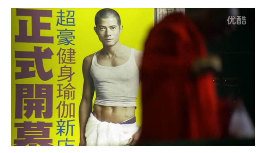
Figure 7. Perspectivist camera trick rendering (the images of) two performers the same size.