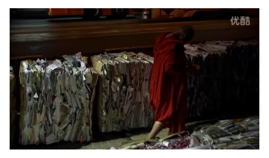
Figure 1. A homeless wanderer.

To begin with, the walker's very form stands in prophetic counterpoint to the enterprise of modernity. His vermillion robe, bald pate, and bare feet are starkly juxtaposed against the backdrop of neon-lit billboards and towering skyscrapers bespeaking Hong Kong's position as a global economic hub. In contrast to the cellphones and cameras sported by numerous passers-by, the humble bun and plastic cup in the walker's hands call to mind the alms bowl carried by mendicant monks, intimating the simplicity and poverty of the renunciate life.<sup>2</sup> By his sheer presence in the Chinese metropolis, he functions as a living icon of the Buddhist tradition in the contemporary world. The walker's iconic import is underscored by the fact that he remains anonymous and itinerant throughout the film. As he makes his way through a deserted street lined with stacks of waste paper after dark (see Figure 1), he cuts a poor and lonely figure, embodying the ascetic ideal of the homeless wanderer that has been one of the most "defining features of the history of Buddhist monasticism" (Gethin 1998, p. 99). Even so, although looking quite out of place during the hustle and bustle of every day, he seems placidly at home in the city at night, when most human activity has come to a cessation.