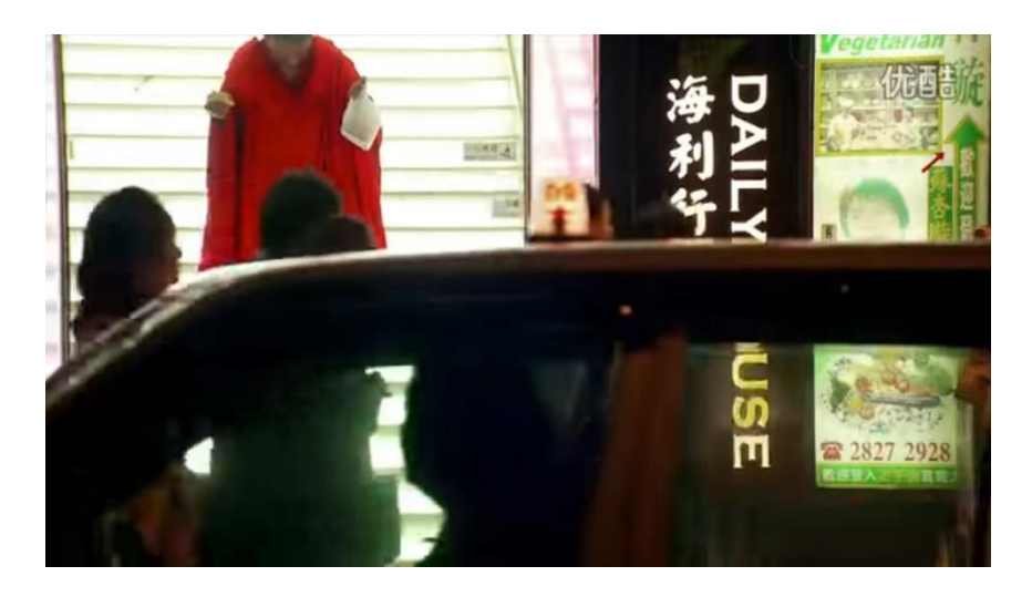
Figure 3. Transitory traffic, intransient walker.

Indeed, whereas Menzan advises that kinhin be practiced in a "quiet place" within the monastery, the walker brings an oasis of quietude into the restive clamor of the city, grounding each shot with a still, meditative presence (Riggs 2008, pp. 242, 244). In Zen iconographic terms, the solitary, stubborn simplicity of Tsai's walker (qua Xuanzang) recalls the figure of a bull, whose movements allegorize "steps in the realization of one's true nature" (Reps and Senzaki 1994, p. 241). This brings us to a core aspect of the Buddhist discourse at work in the film's slow aesthetics. In Mahayana Buddhism, liberation is attained not by active striving, but rather by awakening to the reality of the tathagatagarbha (Skt: "matrix of the Thus Gone"), that is, the Buddha Nature inherent in all things. For Dogen, this innate Buddhahood is paradigmatically realized through zazen or sitting meditation. Given the indivisible "oneness of practice and attainment" (Jpn: shusho itto ), the practice of sitting actualizes the enlightenment that one already possesses. But for Menzan, the act of walking becomes the chief performative embodiment of Buddha nature. According to David E. Riggs, Menzan's focus on kinhin plays upon an alternative reading of kanji characters that, in their broader usage within the Japanese Buddhist context, simply refers to the four basic physical positions that the Buddha himself took (Riggs 2008, p. 224).<sup>4</sup>