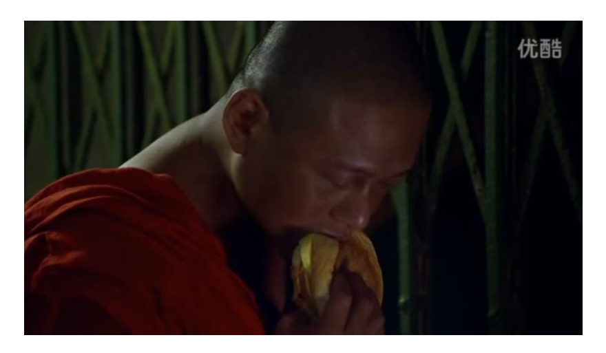
Figure 10. Mindful eating.

Accepting that he can proceed no further than where he already is, in the last shot the walker begins to eat the bun that he has been holding in his hand all this while (see Figure 10). In his slow, simple mastication, the "prospect of vitality" (Duffy 2009, p. 7) and "heightened, intensified way of life" (Jones 1915, p. 157) driving the modern fetishization of speed finds an alternative telos in what we might call the mysticism of the mundane. Here, Tsai is in concert with contemporary proponents of mindful eating, who identify this practice as an ideal path through which human appetites can "be transformed from a source of suffering to a source of renewal, self-understanding, and delight" (Bays 2009, p. 5). By affirming and appreciating basic physiological activities like walking and eating, the film seems to say, moderns can rediscover the sheer joy of simply being alive.