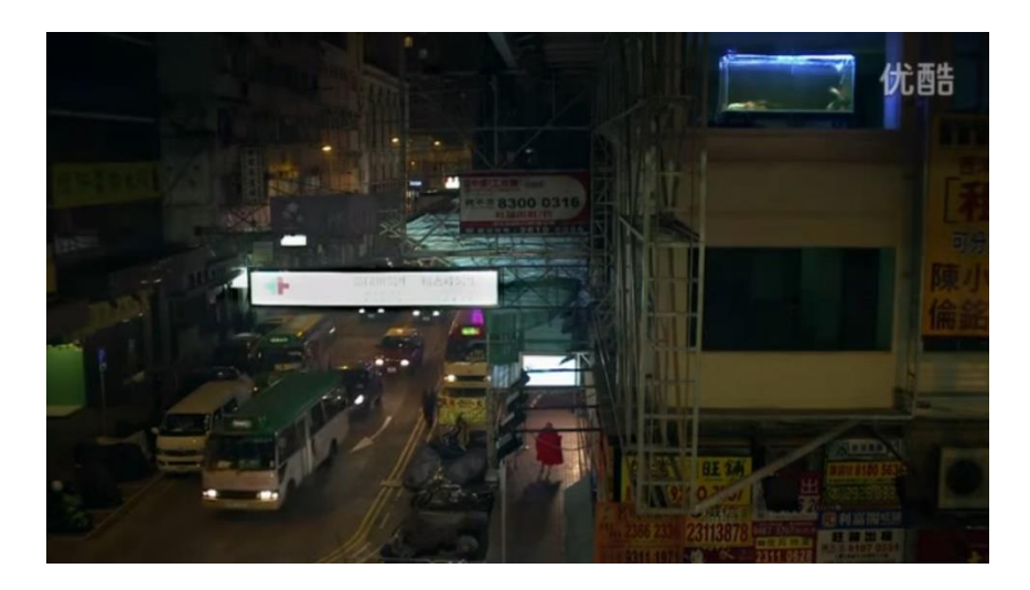
Figure 5. A high angle extreme long shot of the walker, half-hidden by scaffolding.

and hidden by surrounding buildings as he creeps along a scaffolded pavement. But this shot turns out to be a prelude to the more significant ocular riddle that ensues.