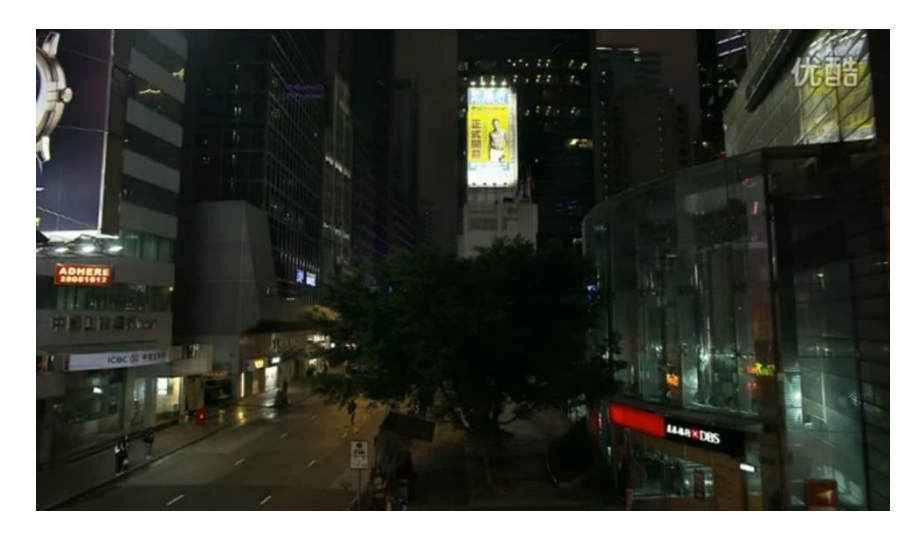
Figure 6. Where's walker? A playful variation on Where's Waldo?

Via what nearly constitutes a bird's eye view shot of Queen's Road Central (see Figure 6), an avenue flanked by commercial buildings, Tsai beckons the viewer to participate in his playful variation on Where's Waldo? In this shot, the walker is reduced to such a miniscule scale that one would probably need to scan the entire screen carefully to spot him. The natural darkness of this night scene leads us to look even more intently. To the right of the shot, there is the glassy, futuristic-looking façade of The Center, one of Hong Kong's tallest and most iconic skyscrapers. To the top, an enormous billboard looms in the distant background, announcing via a yet-unidentifiable model the official opening of some facility. To the bottom and center of the shot, the concrete pavement leads to an august, verdant tree, an unlikely oasis in the middle of the urban jungle. And to the left, a few pedestrians are waiting for taxis as a lit signboard goes off. Here, we finally find the walker, virtually frozen in hyper-slow walking meditation.