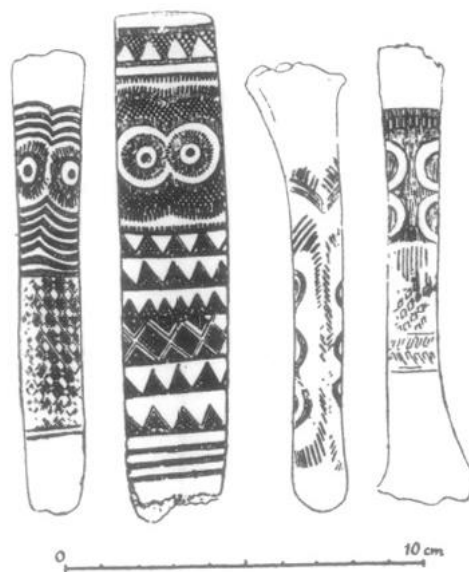
Figure 2. Carved tibiae with ‘owlglassy bicycles’ (FW 208.9) from Almizaraque in south-east Spain (Luquet 1911, p. 443, after Siret 1908).

fill out and deny the void in which they are represented, just as, ultimately, the intention does not faithfully rest in the contemplation of bones, but faithlessly leaps forward to the idea of resurrection. (Benjamin 1998, p. 233)