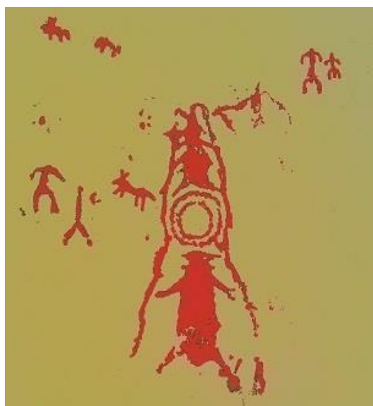
Figure 3. Representation of an ink drawing by the author of paintings within the chamber of Anta da Arquinha da Moura, showing the movement of caprids through a confined space.