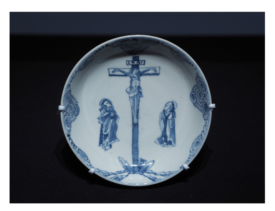
Figure 3. Saucer with the Crucifixion scene, 1662–1722, Nanchang University Museum, Nanchang.

All the incongruities demonstrated on this porcelain, including the detailed depiction and the proportions of the figures, indicate that it may not have been a direct reproduction of a European print and that the design had been altered over time (Howard and Ayers 1978, p. 140). Chinese craftsmen used cross-hatching without washed tones to convey the contrast of light and dark, like the technique of Western sketching. The painting style suggests a European origin, with the motifs likely derived from a copperplate engraving design. The pattern was probably sourced from a European print of a missionary publication. Numerous Chinese porcelains feature the decoration of the Crucifixion of Christ, indicating its popularity as a subject in the early eighteenth century among religious orders in Asia and Europe. They currently can be found at the National Museum of Ancient Art in Lisbon, the Peabody Essex Museum in Boston, Christie's Auction in London, the Asian Civilisations Museum in Singapore, the Macao Museum, and the Guangdong Museum. The collection includes porcelain jars featuring Christ flanked by stylized tulips and leafy lotus scrolls. Le Corbeiller (1974, p. 17) observes a connection between the scrolling floral design and Chinese export embroidered ecclesiastical textiles.