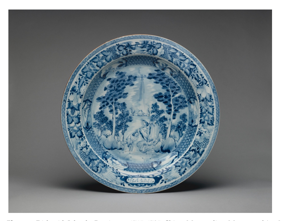
Figure 4. Dish with John the Baptist, ca. 1715–1725, China. Metropolitan Museum of Art, New York.

This large dish (Figure 4), painted in blue and white, depicts the Baptism of Christ in the river Jordan. According to Krahl and Harrison-Hall (1994), Christian symbols were present on Chinese porcelain made for the Portuguese during the Ming dynasty. However, this large dish is among the earliest examples depicting a scene from the Bible.