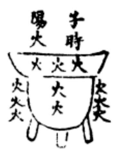
Figure 16. The method of using the tripod (yongding fa 用鼎法) (Zhao 1988, p. 260c).