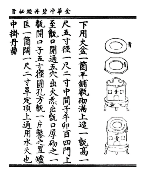
Figure 6. Picture of Zeng 甑 (Bai 1988b, p. 162a).

To refine the form, the cultivator has to use the body as the state, use the heart as the emperor, and use the essence as the people. The form is the furnace, and the head of the cultivator is the tripod. Because the head is full of the essence, it must be refined by fire 鍊形,以身為國,以心為君,以精為民。形者,鑪也。 首者鼎也。精滿於腦,故用火鍊. ( Zazhu zhixuan pian 1988, p. 614; Bai Xiansheng Qiongguan Zazhu Zhixuan Ji 1271, p. 3.4a)