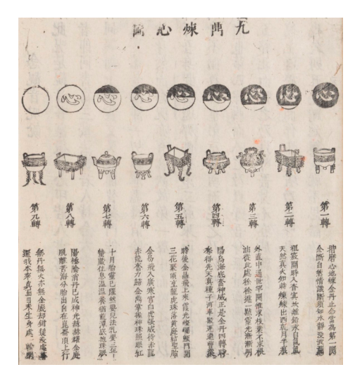
Figure 14. Diagram of refining the heart by the nine tripods (Wu 1615, 1.41).

Thereafter, the innovations in Longmeizi's tripod set a model for the inner alchemy of later times. For example, Xingming guizhi 性命圭旨, which is an inner alchemical manual published at the end of Ming dynasty (Wu 1615), depicts the nine tripods in the "diagram of refining the heart through the nine tripods" (Jiuding lianxin tu 九鼎煉心圖, Figure 14) (Wu 1615, p. 1.41). This diagram illustrates nine different shapes of tripods, which correspond to the nine hearts with different degrees of cultivation. Depicting heart refining is carried out through the lunar phases, suggesting a consistency with the diagram of nine tripods in Jinye huandan yinzheng tu. Here, the nine tripods, the nine cyclical transformations, and the lunar phases are integrated in one diagram.