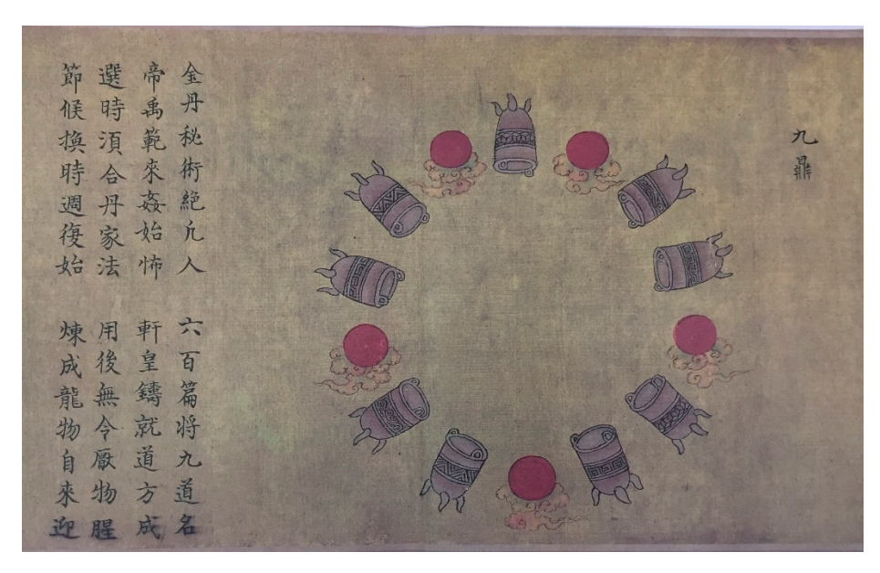
Figure 13. Diagram of the nine tripods, Jinye huandan yinzheng tu , colored scroll version, collected by Baiyun Daoist Monastery of Beijing.

Yu's contribution to the tripod was finally recognized by Daoism. In addition, the second sentence of Longmeizi's poem refers to a numerical concept related to the "nine" of the nine tripods: