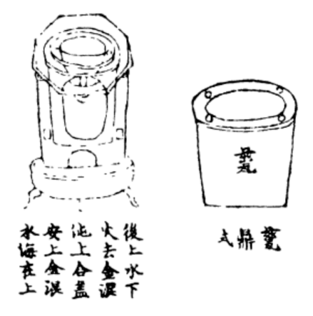
Figure 5. The Seventh Reverted Elixir of Pervading Mystery in the Five Great Mountains ( Huandan diqi zhuan wuyue tongxuan dan 還丹第七轉五嶽通玄丹) and the diagram of its refiner (Bai 1988b, p. 167a).

Jinhua chongbi danjing mizhi shows that Bai Yuchan inherited the achievements of outer alchemy and "decorated" (修飾) them with his theories of inner alchemy (Meng 1993, p. 286). In other scriptures, Bai's definitions on the tripod are all from the angle of inner alchemy, such as: