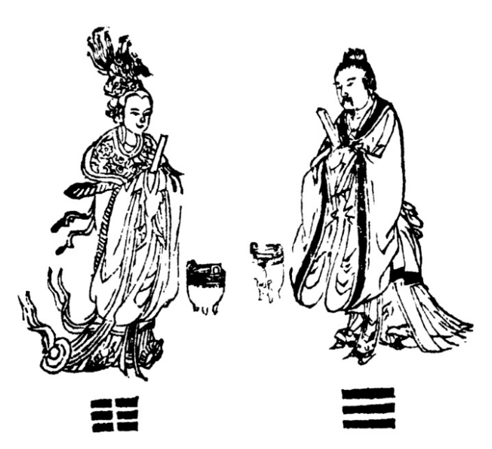
Figure 8. The diagram of the tripods found in the Daoist Canon version.