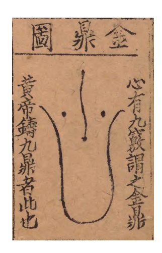
Figure 7. Picture of the Golden Tripod.

The mind with nine orifices is called the golden tripod. That is the nine tripods made be the Yellow Emperor. 心有九竅謂之金鼎,黃帝鑄九鼎者,此也. ( Bai Xiansheng Qiongguan Zazhu Zhixuan Ji 1271, p. 1.2a)<sup>21</sup>