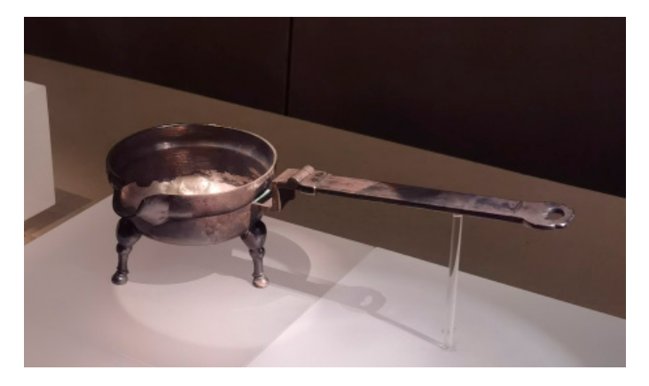
Figure 1. A silver pan (cheng 鐺) of the Hejiacun Tang treasures.

The tripod did not exist in the practice of the outer alchemy. In Taiqing danjing , the tripod could be used as a container for melting the great clarity elixir (Ge 1996, p. 77). According to Wuling danjing 五靈丹經, Ge Hong introduced the manufacturing method of the Elixir of Instant Success ( lichen dan 立成丹). In this method, the alchemist first had to obtain copper by heating realgar and then cast a ware. This description does not indicate the type or shape of this ware, but it was by no means a tripod (Ge 1996, p. 79). In 2018, archaeologists excavated a vessel of so-called alum water ( fanshi shui 礬石水) in a Western Han tomb of Luoyang, which was initially thought to have been refined through the method documented by Ge Hong. It is a great discovery in the study of outer alchemy, but the container is a bronze jar, not a tripod (Jiang et al. 2019). Another case comes from the hoarded treasures of the Tang dynasty excavated in Hejia Village, Xi'an. There are three kinds of vessels used for heating elixir. Two of them look like pots, while the third one has a handle, an explicit change to the shape of tripod (Figure 1). According to the alchemical materials found inside and the inscription written on the vessels, "nuanyao" (暖葉, warming elixirs), these vessels were used for refining elixir (Qi et al. 2003, pp. 159–71).