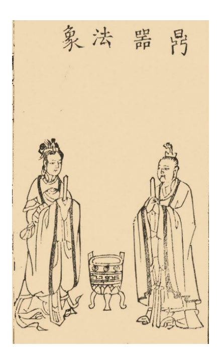
Figure 9. The diagram of the tripods found in the Hanchanzi annotated version.

As an important scripture of Daoist inner alchemy, numerous scholars have focused on Jinye huandan yinzheng tu (Wang 2007, p. 36; Wang 2012, pp. 61–82; Shi 2015, p. 152). Shawn Eichman indicates that the diagrams represent the process of inner cultivation, noting the differences of the faxiang between inner and outer alchemy (Little and Eichman 2000, pp. 344–47). Xu Yilan provides captions for every diagram, applied the three methods of Chen Tuan 陳摶 to read the Jinye huandan yinzheng tu , and identified its huge impact on later illustrations of inner alchemy and Visualization and Meditation ( cunsi 存思) (Xu 2009, pp. 182–217). However, Longmeizi mentions where he learned Daoism in the prologue and epilogue; so, I posit that the emphasis in studying Jinye huandan yinzheng tu should fall on how the diagrams express the inner alchemical theory of the Southern Lineage of the Golden Elixir.