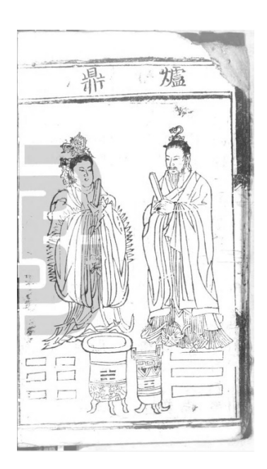
Figure 10. The diagram of the tripods found in Yiyuzi poetic version.