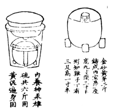
Figure 4. The Fifth Reverted Elixir of the Three Clarities' Treasure ( Huandan diwu zhuan sanqing zhibao dan 還丹第五轉三清至寶丹) and the diagram of its refiner (Bai 1988b, p. 166a).

chamber named shenshi 神室 along with other auxiliary materials, and altogether hung on the stove to refine elixir. According to the manual, the tripod is more complex than the traditional tripod, bearing a closer resemblance to the Suspending Fetus Tripod of Danfang baojian zhitu . Looking at the eleven diagrams of Jinhua chongbi danjing mizhi , none of them could be classified as the traditional tripod. However, there may be two exceptions. The Fifth Reverted Elixir, Sanqing zhibao dan 三清至寶丹 employs an inner chamber with three legs (Figure 4). Here, the author characterizes the inner chamber as the "inside tripod" ( neishi ding 內室鼎) (Bai 1988b, p. 166a), but he also calls the entire diagram "Picture of Tripods" ( dingqi tu 鼎器圖). The same thing happens in the Wuyue tongxuan dan 五嶽通玄丹, the Seventh Reverted Elixir (Bai 1988b, p. 166c–167a). Its diagram calls a porcelain tripod that exhibits an extra pedestal with three legs (Figure 5). These diagrams of Sanqing zhibao dan and Wuyue tongxuan dan conform with the manual to make the "outer tripod." Moreover, in another diagram, Bai Yuchan described the pedestal with three legs as zeng 髋 (Figure 6). He indicated that the device is used for placing the tripod (Bai 1988b, p. 162a). <sup>18</sup> In other words, this three-legged pedestal is not tripod.