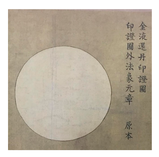
Figure 12. Diagram of yuanben in Jinye huandan yinzheng tu , colored scroll version.

Other specific scenes are easier to draw than transcendental concepts, but these have no artistic charm and the metaphorical depiction is clumsy. For example, using heaven and the ocean to stand for the difference of yinyang 陰陽 and qiankun 乾坤; drawing gods, officials, rich people, farmers, animals, and devils in a circle to stand for the Transmigration of the Six Grades (六道輪迴) in jingwu 警悟 (warning and understanding); a man and a woman standing with two tripods to reveal that they are equal in dingqi (鼎器, tripod); a boy and a girl in two circles with different colors to show the match of genders and the two elements, lead and mercury; and the dragon and tiger taking the elixir, but the tiger possessing a dragon-snake body for holding a balance in the frame.