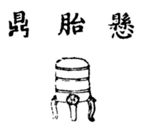
Figure 3. The Suspending Fetus Tripod in Danfang baojian zhi tu (Zhang 1988, p. 713a).

The description complies with many technical rules of outer alchemy. It is hard to judge whether the diagram or the description came first, but the latter offers many metaphors to imagine and explain the shape of tripod. The first is penghu 蓬壺. As a common concept in Daoism, penghu is used to represent Penglai Immortal Island (蓬萊仙岛), which is shaped like a pot. 14 Peng is also a concept that compares fang 方 and yin 瀛. 15 Perhaps it indicates the lotus pod, but the explanation I offered above also stated that the Suspending Fetus Tripod is similar to the human body. Then, the writer provides the second metaphor: the three parts of the tripod signify the three main elements of the universe (sancai 三才): heaven, earth, and humanity. Furthermore, the so-called Suspending Fetus means that it has the legs to enter the oven and furnace, which prevents the main part of tripod from touching the flames directly. Taking into consideration this technical description, Cao Yuanyu and Needham cited the diagram when they discussed the implements of outer alchemy (Cao 1933; Needham et al. 1980, p. 17), but this diagram belongs to Danfang baojian zhi tu 丹房寶鑑之圖, which was used in annotating the inner alchemical scripture Wuzhen pian. Before the diagram of Suspending Fetus Tripod, the writer also drew the diagrams of the Yin and Yang (陰陽), dragon and tiger, true land (zhentu 真土), mercury, and lead to explain the theory of inner alchemy. 16