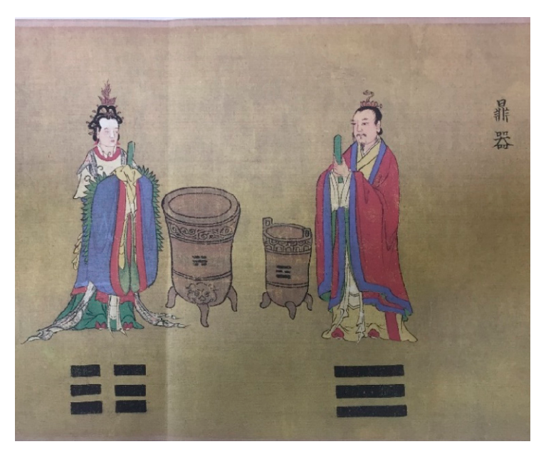
Figure 11. The diagram of the tripods found in the colored scroll version<sup>34</sup>.