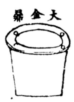
Figure 2. The golden tripod of the heavens (Bai 1988b, p. 165b).

The shape of the crucible or tripod in outer alchemy took on different forms. In Huangdi jiuding shendan jingjue , an isolated of iron "tripod" (鐵鏡代) was manufactured to support the crucible, which replaced the original structure of the tripod. Unfortunately, there is no archaeological evidence of the crucible or iron tripod. The followers of Ge Hong drew a few diagrams in Song dynasty (960–1276, Figure 2); however, none of the diagrams drawn in Song dynasty or modern times bear any resemblance to the traditional bronze tripods. The Furthermore, there is no evidence that alchemists used nine tripods in alchemical activities or related rituals. In fact, almost all the historians of science who care about Daoist alchemy have detected an aqueous solution (shuifa 水法)—which dominated the whole craft after the Tang dynasty (Ts'ao et al. 1959). Shuifa has one specific space for storing water on the bottom and another space for storing raw materials in the upper part. In contrast, the traditional tripod only has one space.