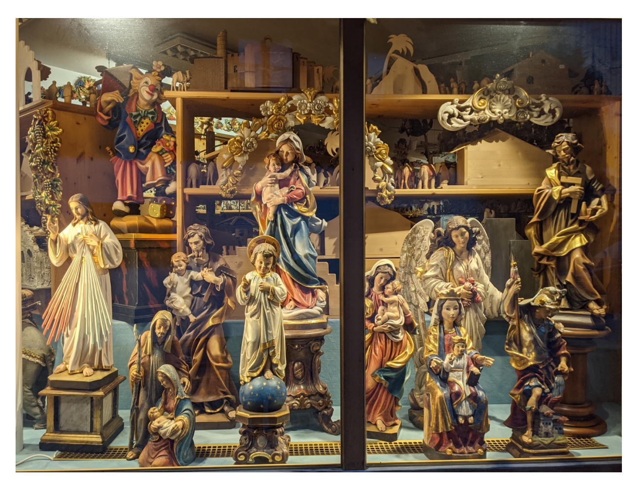
Figure 4. Window of a carver's shop in Oberammergau.

what prevails in today's carving stores are the iconographically familiar pictorial formulas of the Christian history of salvation: the Crucifixus, the Holy Family, the Pieta. However, mundane objects, figures and arrangements are also exhibited. This leads to constellations which pious observers might find offensive, e.g., when a statue of Mary is placed next to a clown with dice, a toy castle, and wooden animals (Figure 4).