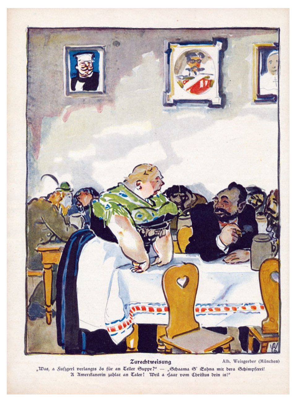
Figure 2. Jugend 26 (1910), p. 606.

The ambivalence of hair between remain, memento, relic, and nauseating remnant is a recurring motif in the satirical Oberammergau discourse of the early 20th century. For example, an illustration in the Munich magazine 'Jugend' shows the waitress of an inn in dispute with a guest who complains about the extortionate price of the soup (Figure 2).