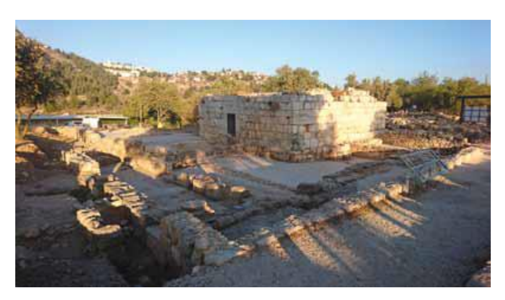
Figure 4. Current place of Jami'al-Yatim, looking from northwest.

translated as "the eternal" (Wilson 1873, p. 38). Three years later Conder wrote that the place was called "Jami 'a-Taim," interpreted as "mosque of God's servant" (Conder 1876, p. 192). For more about the mosque and the elements taken from the surrounding churches, such as columns and chancel, see Andersen (1985, pp. 48–49). Below Jami'al-Yatim two churches were discovered, one on top of the other, which we denote "the northern churches" (Schwartz and Shemesh 2019, p. 8). An Ayyubid coin found in the foundation ditch of the mosque may indicate that it was established in that same period (Magen and Aharonovich 2012, p. 205).