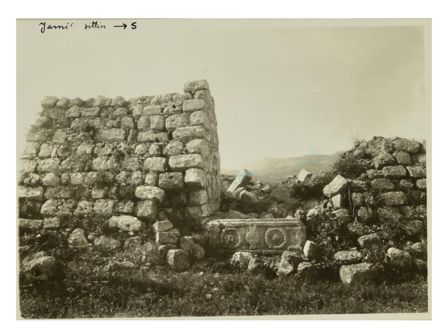
Figure 3. Jami'al-Sitin and the polytheistic burial trough as lintel, from North. From the British Archive SRF_171 (http://www.iaa-archives.org.il/zoom/zoom.aspx?id=43097&folder_id=3380&loc_id=1025) (accessed on 27 September 2020).

The researchers' conjecture regarding identification of the structure as a synagogue was based on the assumption that in medieval times Jews resided at the site or at least had a synagogue or ritual place there, as mentioned by the travelers. In fact, from the Roman period on we have no knowledge of a Jewish presence on-site, and during the period under consideration it was solely a Muslim holy place, and only occasionally did Jews visit and develop a similar tradition. This state of affairs was characteristic of most holy places in Mamluk Eretz Israel. Very few places were maintained by Jews in practice, and Jews usually only visited existing Muslim places of worship (Reiner 1988, p. 253). At the same time, it is not possible to prove unequivocally that a small number of Jews, such as merchants, did not live there, but, as stated, we have no evidence of this.