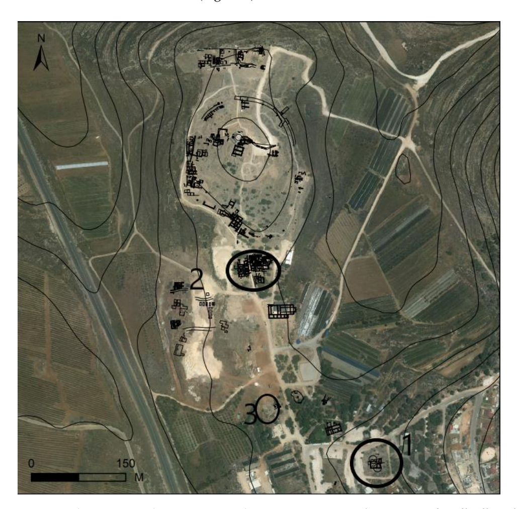
Figure 1. Site Plan: 1: Jami'al-Sitin. 2: Jami'al-Yatim 3. open-air Weli