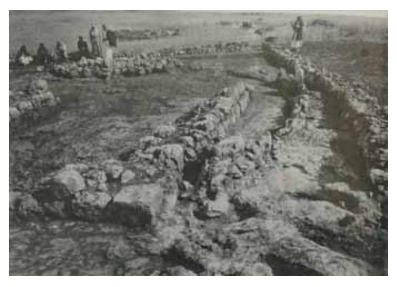
Figure 7. The open-air Weli from south, excavated in 1926, from Andersen 1985, p. 76.