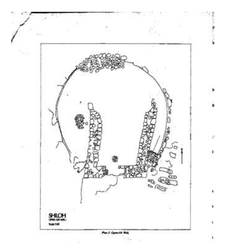
Figure 6. The plan of the open-air Weli, from Andersen 1985, plan J.

The third structure is a holy Muslim structure of the open-air Weli type. In present times it is no longer visible, but the Danish excavators contended that it had been a medieval Muslim ritual structure as it contained a mihrab (Figures 6 and 7); (Kjaer 1927, pp. 209–11; Andersen 1985, pp. 76–77). <sup>11</sup>