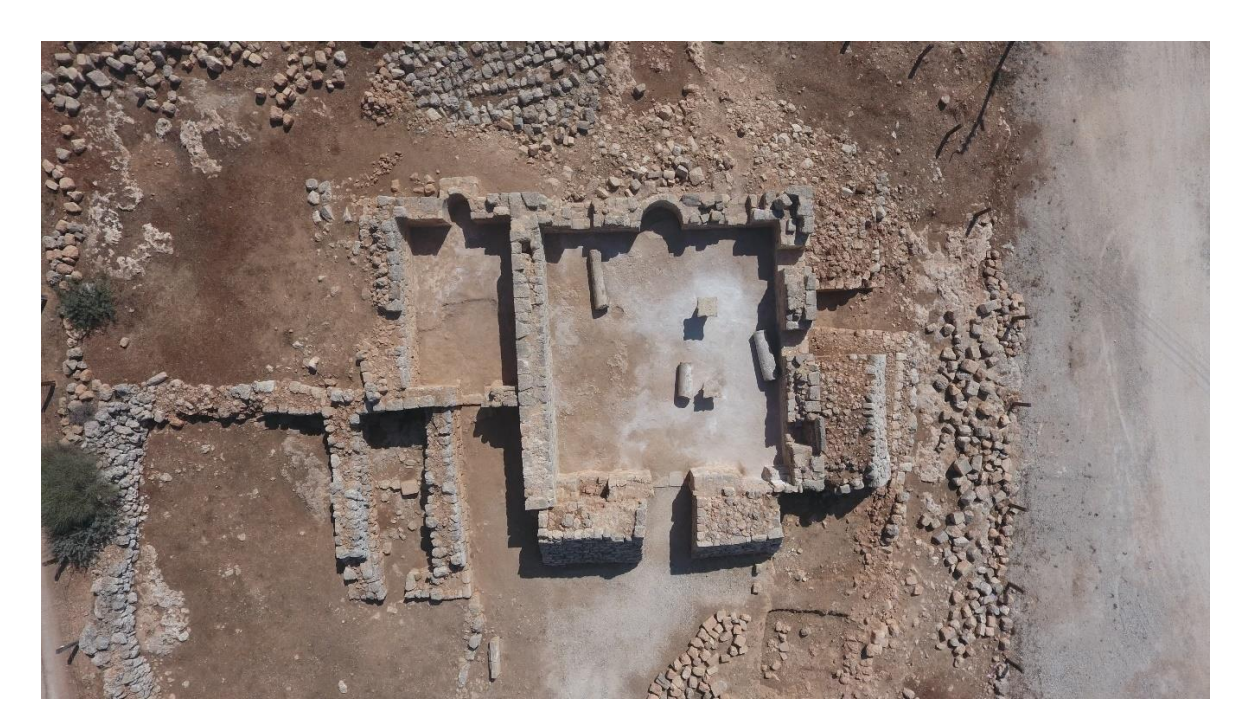
Figure 2. Jami'al-Sitin : South to the top, courtesy of https://www.a-shiloh.co.il/en (accessed on 23 September 2020).