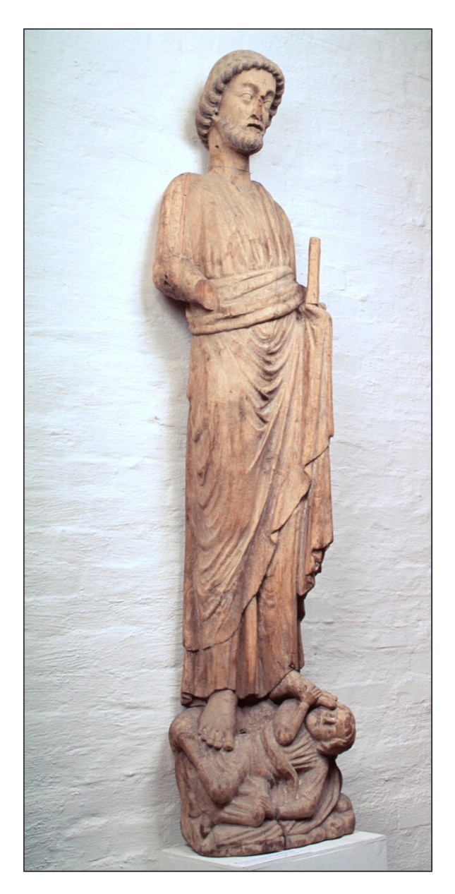
Figure 3. "The Grain God of Vånga", a 13th century apostle from Norra Vånga parish.

child could be borrowed from Madonna sculptures in such cases. The strength of this tradition could possibly be evident from the fact that the child was often sculpted separately from the Virgin for easy removal (Stolt 1996, pp. 407–19). Such cases, while only rarely figuring in the sources, demonstrate the portable character of the sacred, and how the holiness of church space could be transferred to a domestic setting.