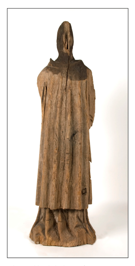
Figure 2. "The Vebomark God", possibly a holy deacon, from Lövånger parish.

Other sculptures could be temporarily removed from their more permanent placements in churches and chapels to the actual homes of laypeople. This seems to have occurred in particular in association with childbirth. The axe of St. Olaf is one such example. Writing in 1760, travelling topographer Carl Frederic Broocman wrote of such an axe in the parish of Västra Husby, Östergötland. By the mid-eighteenth century, the sculpture of St. Olaf in the parish church was missing the axe that the Norwegian royal saint was usually depicted with. According to Broocman, this was the result of the continuous use of the axe by women in labour: