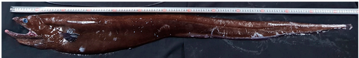
Supplementary Figure S3. Photographs of two deep-sea eel specimens. (A) Synaphobranchus brevidorsalis and (B) S. affinis .