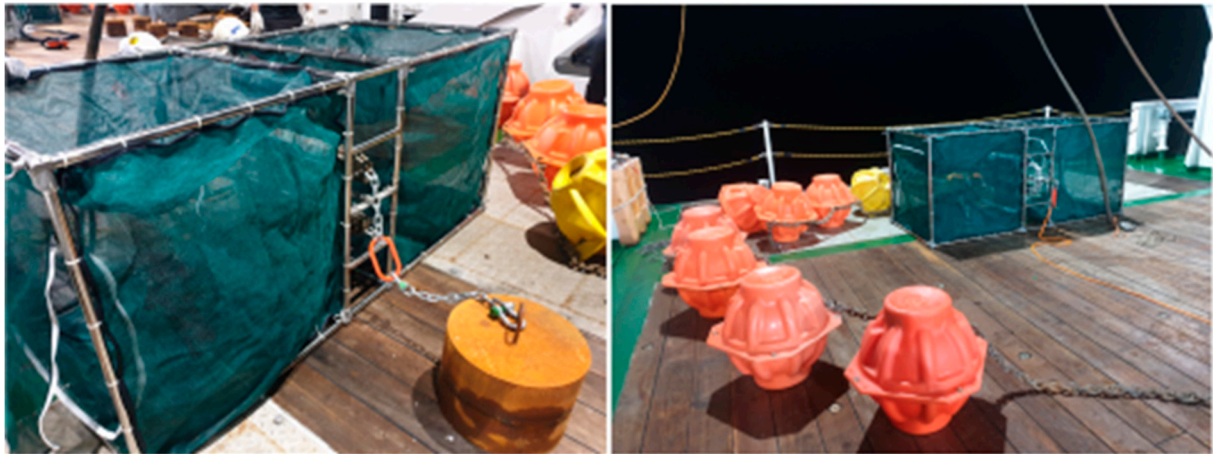
Supplementary Figure S2. Fish sampling using bait traps (composed of fish).