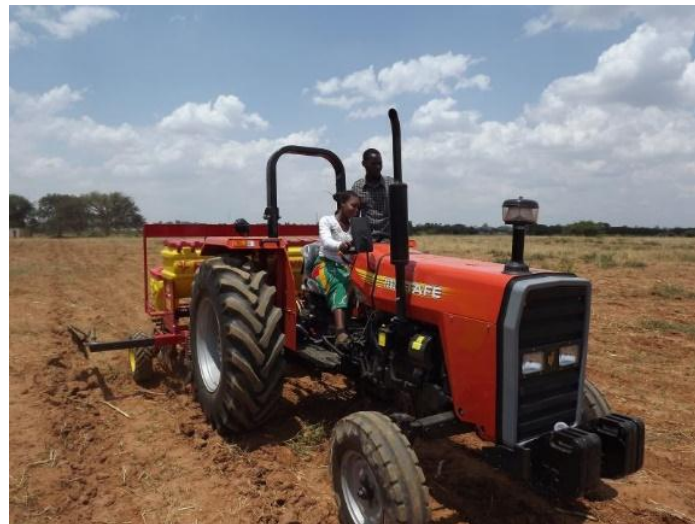
Figure 3. Training in field operation of a tractor-mounted no-till planter.

Field operation: Once calibration has been mastered, then all machines should be used extensively under field conditions, so that the operator gains experience in the field (Figure 3). This is not, of course, confined only to successfully piloting of the machinery in the field. At the same time, extensive use should be made of the operators' manual to ensure that the machine is correctly adjusted at all times. This will include levelling the machinery both laterally and longitudinally, selecting working speed, maintaining row width, adjusting planting depth and seed coverage, and so forth.