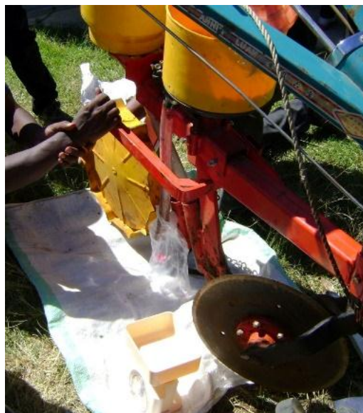
Figure 2. Calibration of a single-row no-till planter. The drive wheel is turned by hand and the seeds collected in a plastic bag attached to the seed outlet. Seeds can be counted and/or weighed to calculate seeding rates per ha.

From here, it is a simple matter to calculate the planting rate per hectare when the distance between crop rows is factored in. Furthermore, if the seeds are weighed, then the weight of seed sown per hectare can be easily calculated.