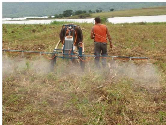
Figure 1. Draft animal powered boom sprayer.

Innovations are needed when farmers opt for chemical weed control, as the conventional option is the knapsack sprayer, which is notorious for contaminating the operator. Knapsack sprayers can be mounted on a wheeled chassis, fitted with a multi-nozzle boom and hand-pulled, so partially removing the operator from the risk of contamination. Larger capacity boom sprayers are manufactured for animal traction (Figure 1).