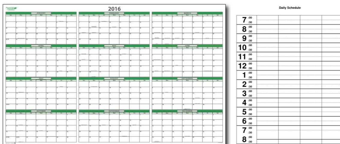
Figure 6. Annual work plans can be made on a wall chart; daily plans are needed for detailed scheduling.

between them. A daily planner can assist in this process, together with the maps obtained or made during market research.