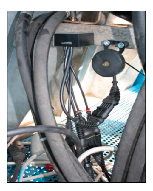
Figure 5. Microprocessor and beeper.

When the sensor no longer detects the metal surface on the drum for a time less than or equal to 6 seconds, the system activates the blinking and deactivates the output to release the movement of the mechanical organs by stopping its movement as a function of the motion detection by the sensor mounted on the tractor PTO (Figure 6). Consequently, the microprocessor determines the disengagement of the multidisc clutch as a result of the internal pressure loss of the decoupler generated by the electric pump and thus allows decoupling transmission to the manure spreader that stops while the tractor PTO continues to be active.