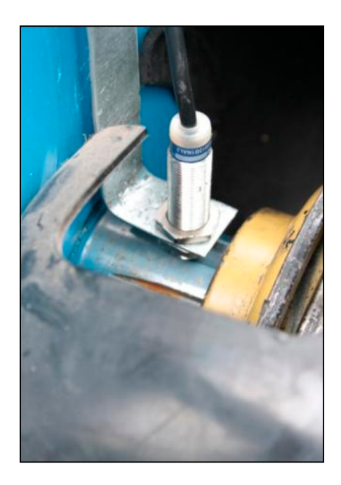
Figure 6. Sensor on PTO.

In order to prevent the motion transmission in case of failure in connecting to the 12 V power supply, the used clutch is of the "normally open" type.