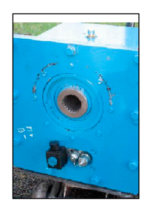
Figure 2. The prototype device.