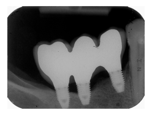
Figure 3. Periapical radiograph at 58 months of follow-up with peri-implant disease diagnosed in implant #45 with the presence of peri-implant pockets of 5 mm and a three threads marginal bone loss.

Figure 2. Baseline periapical radiograph (at one year of follow-up) from a 59 years old female patient with no history of periodontitis who was a non-smoker, rehabilitated with a three-unit implant-supported rehabilitation [three implants of 7 mm in length, positions #44–#46; Risk points = -1 due to adjacent implants or teeth present) restored using metal–ceramic material (Risk points = 2). Bacterial plaque (Risk points = 2) and bleeding (Risk point = 2) were present, and the bone level was located on the implants' coronal third. Due to the presence of bacterial plaque and the presence of adjacent implants or teeth, 3 risk points were added. A total score of 8 points was registered for this patient which corresponded to the very high-risk group.