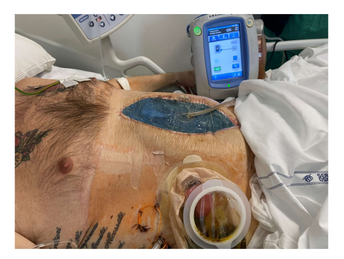
Figure 7. NPWT. (Personal observation).

The application of a specially designed non-adherent layer of NPWT system was a breakthrough element that improved the long-term results in the field of OA treatment significantly [6,13,118,131]. It was proven that NPWT facilitates spontaneous EAF closure, especially those characterized by distal location and low-output fistula [2]. The aim of this strategy, which can also involve NPWT, is to transform the fistula into a controlled stoma (Figure 7).