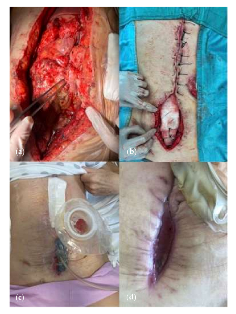
Figure 5. (a) A 65-year-old woman undergoing multiple surgical procedures with consequent various fistula formation. (b) A jejunostomy was performed with application of NPWT on white foam on the midline laparotomy. (c) NPWT on the midline incision 4 weeks after the first surgery. (d) Wound at 6 weeks. (Personal observation).

Once sepsis and electrolyte imbalance have been treated, defining the fistula anatomy is mandatory. So, a CT scan, a fistulography or a bowel/colonic transit have to be performed. Studying the rectum or colon patency is also useful, especially in those patients who had a colostomy or diverticulitis.