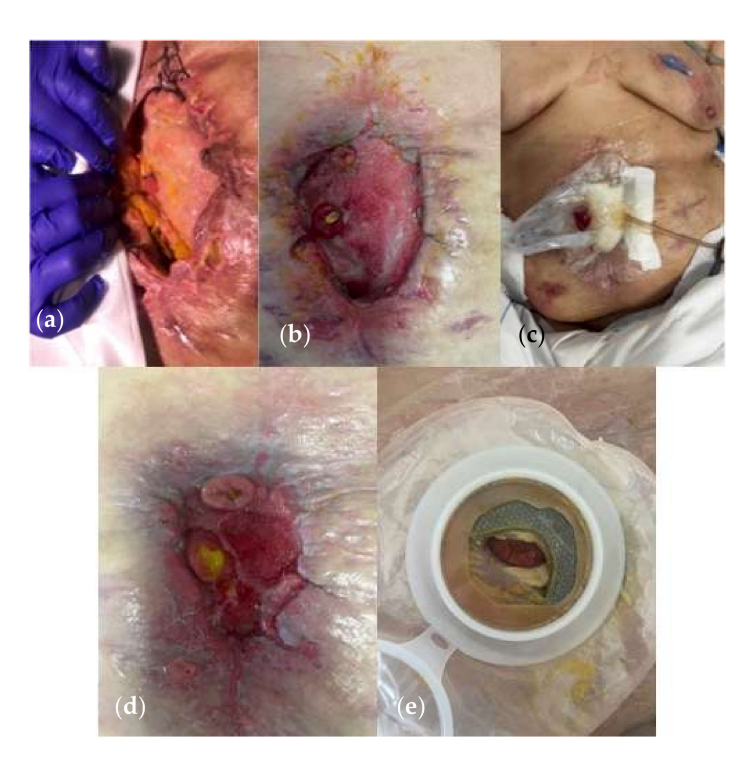
Figure 9. (a) A 54-year-old patient undergoing surgery for perforated diverticulitis with resection of the sigmoid colon and anastomosis. (b) Postoperative course complicated by dehiscence requiring multiple surgical re-explorations with consequent frozen abdomen and jejunal fistula. ( c – e ) She was treated with NPWT on white foam surrounding the fistula and a stoma bag connected to the machine through a large tube. Low negative pressure levels were set—50 mmHg. (Personal observation).