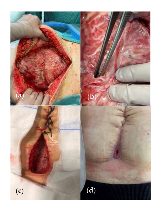
Figure 8. (a) A 36-year-old patient affected by multiple small bowel fistulas due to complications of ovarian cyst removal and consequent frozen abdomen. (b) EAF. (c) Treatment consisted of visceral NPWT with AbThera first and white foam later, allowing a progressive local improvement. (d) Injection of mesenchymal stem cells was performed at this point consenting a fistula and skin complete closure [142,143]. (Personal observation).

Thus, methods of isolation of bowel secretion have been reported and are under study. These are fundamental in order to protect the OA, prevent ongoing sepsis, estimate fluid loss volume and consistency, and facilitate the nursing of the patient. With the constant advances in the field of NPWT, many modifications of NPWT have been reported, especially designed for OA management complicated with EAF. Different techniques are described for fistula isolation, for example, fistula diversion to a floating stoma, Fistula Vac, Tube Vac, Nipple Vac, and Silo Vac [124,129,146,147]. All these techniques are based on individual combinations of different tools used in stoma care and require creativity as well as patience. At the end, a stoma bag is placed on the NPWT dressing to collect the fistula effluent.