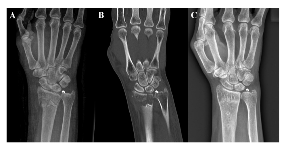
Figure 1. Radiographs of a 70-year-old woman. ( A ) Preoperative posteroanterior radiograph and ( B ) coronal computed tomography image revealing sclerosis with cystic changes on the ulnar side of the lunate; ( C ) posteroanterior radiograph acquired after the removal of internal fixation at 12 months after surgery reveals the remnant sclerotic lesion with cystic change of the lunate.